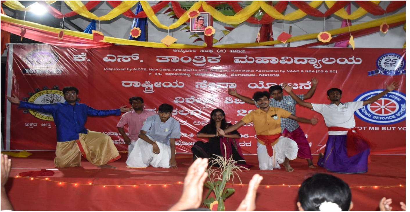
Cultural program by NSS volunteers