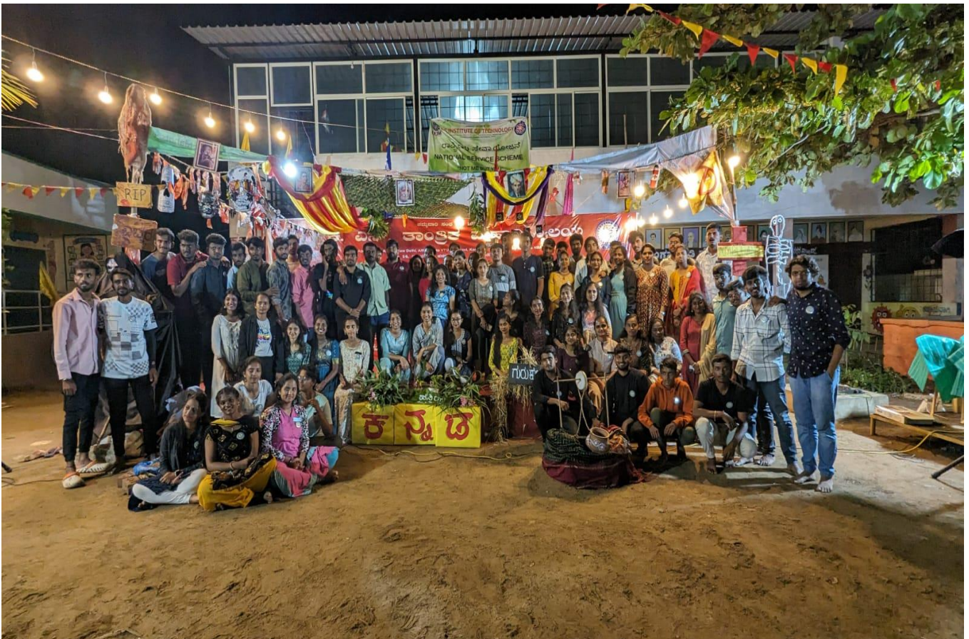
Group photo of NSS volunteers