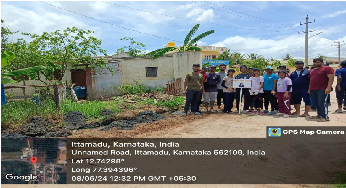
Volunteers cleaning the village streets