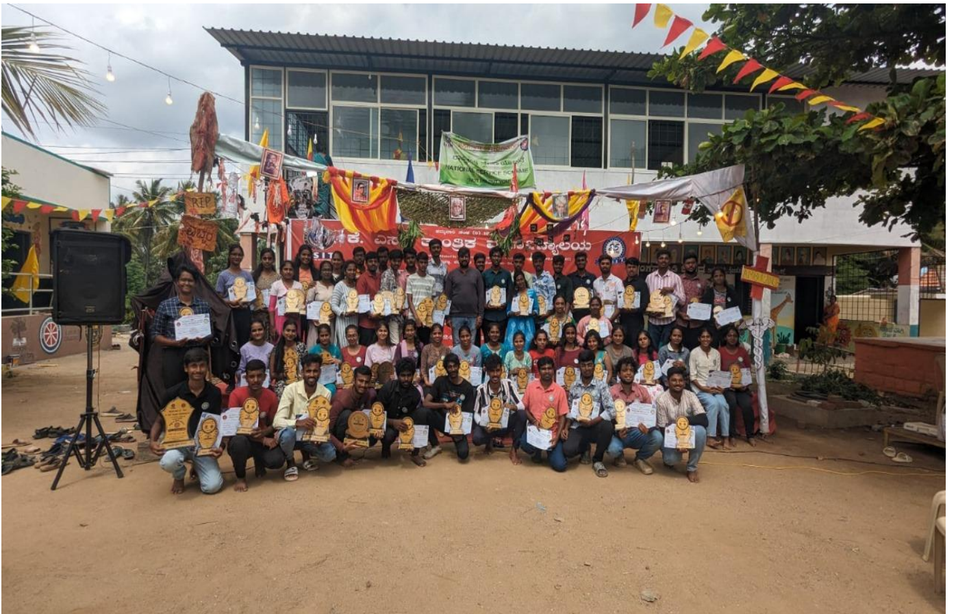
Group photo of NSS volunteers