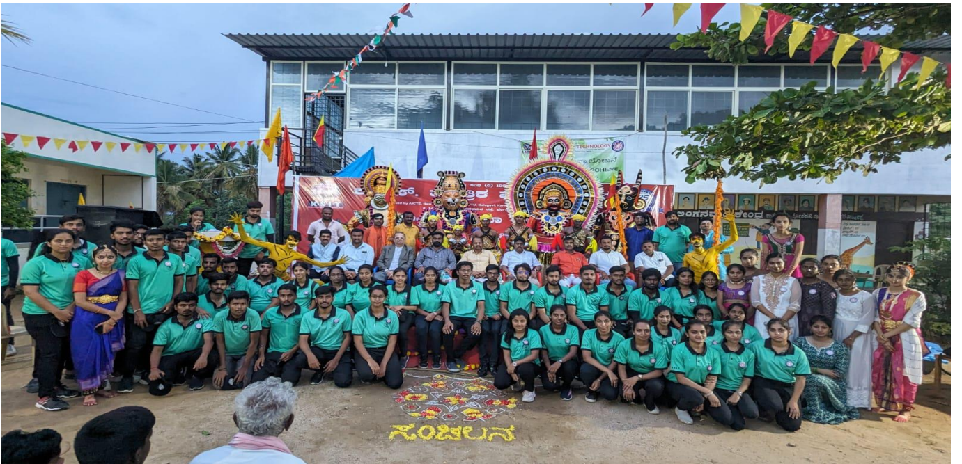
Group photo of NSS volunteers along with the Guests