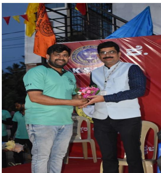
NSS Program officer welcomes the Principal to inaugural function