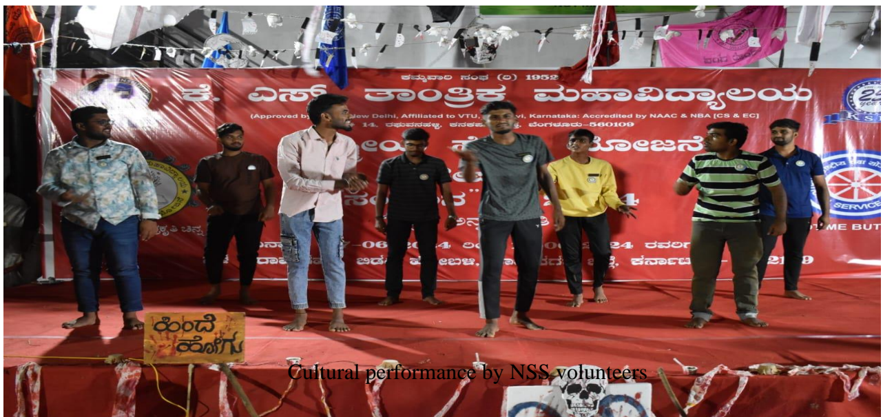
Cultural performance by NSS volunteers