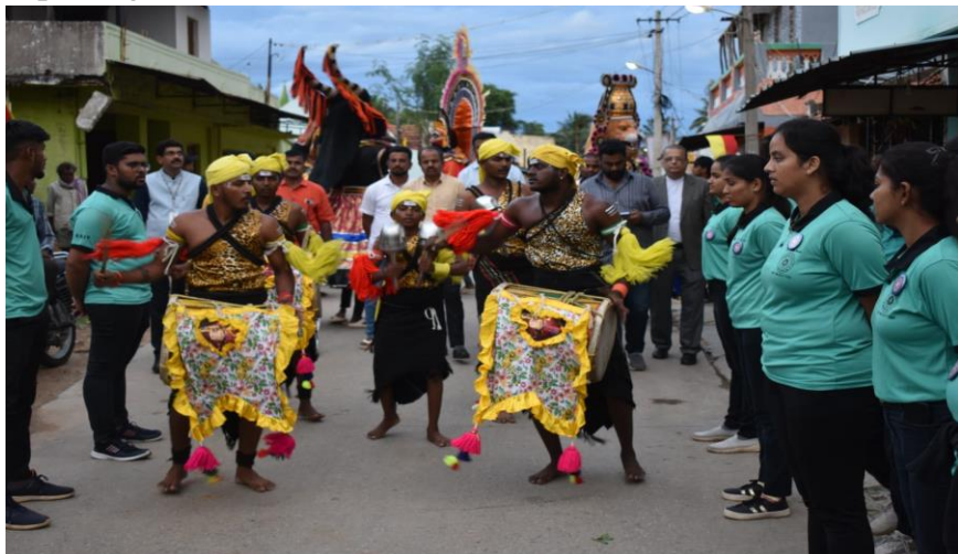
Guests entering the Inaugural function

All the teams and their members engaged in thorough discussions about the tasks allotted to them, carefully planning their execution to ensure effectiveness. Each team strategized on how best to accomplish their responsibilities, fostering a collaborative and organized approach. Following these productive discussions, everyone proceeded to their assigned accommodations to rest for the night. We concluded our day by reflecting on our experiences and writing about the day's events in our diaries, capturing the memorable moments and valuable lessons learned.