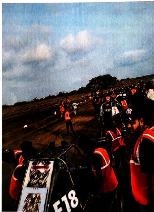
Photograph 4: E- 18 on ENDRANCE RACE