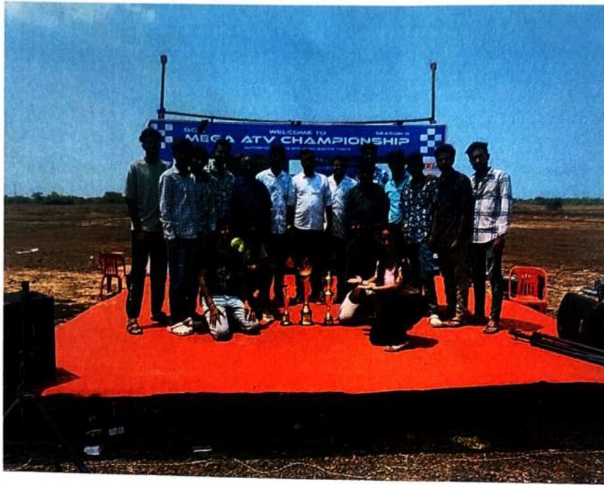
Photograph 5: Team after Winning the trophies with Organizers