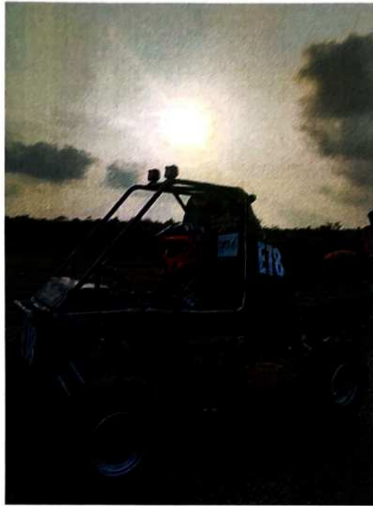
Photograph 1: Vehicle ready to compete