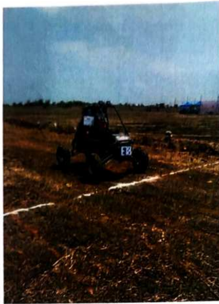
Photograph 3: E- 18 on Flat Dirt Race