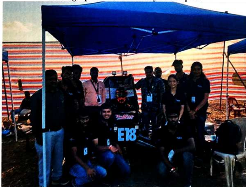
Photograph 2: Vehicle cleared Technical Inspection and Brake test