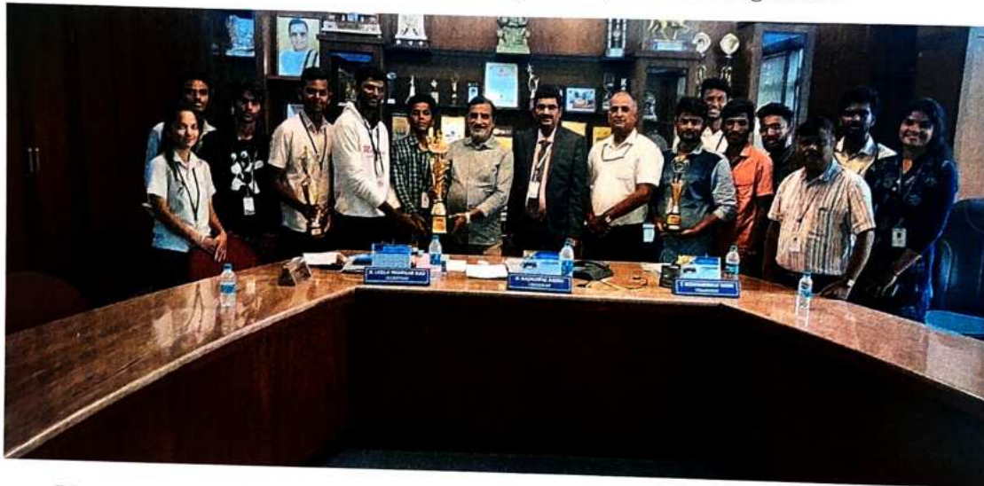
Photograph 6: Team with Management, Principal sir AFTER winning TROPIES