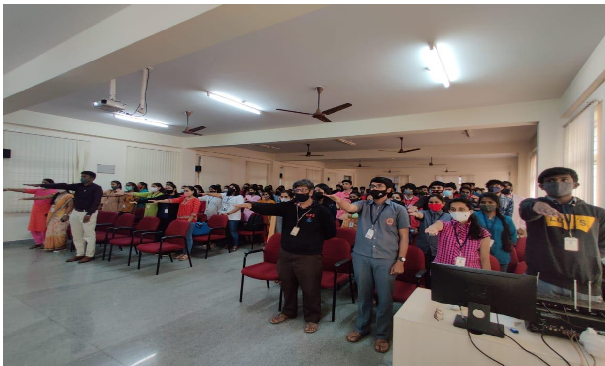
Faculties, NSS volunteers and other students taking the pledge