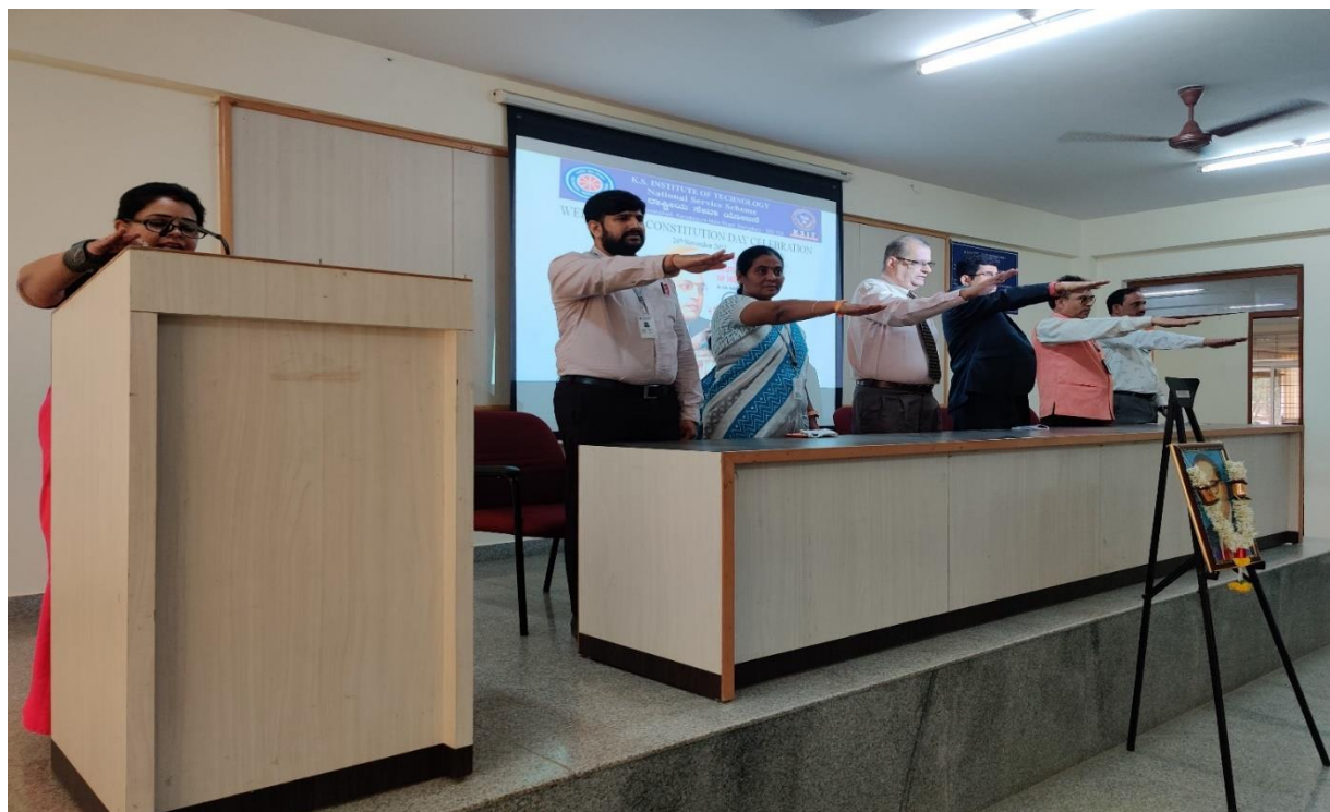
Dignitaries taking the Pledge

gathering regarding the importance of Preamble of Indian Constitution. Later, all the Dignitaries, NSS volunteers and students took the pledge of the preamble of Indian Constitution.