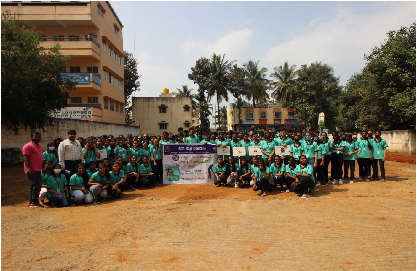
Group photo of NSS Volunteers