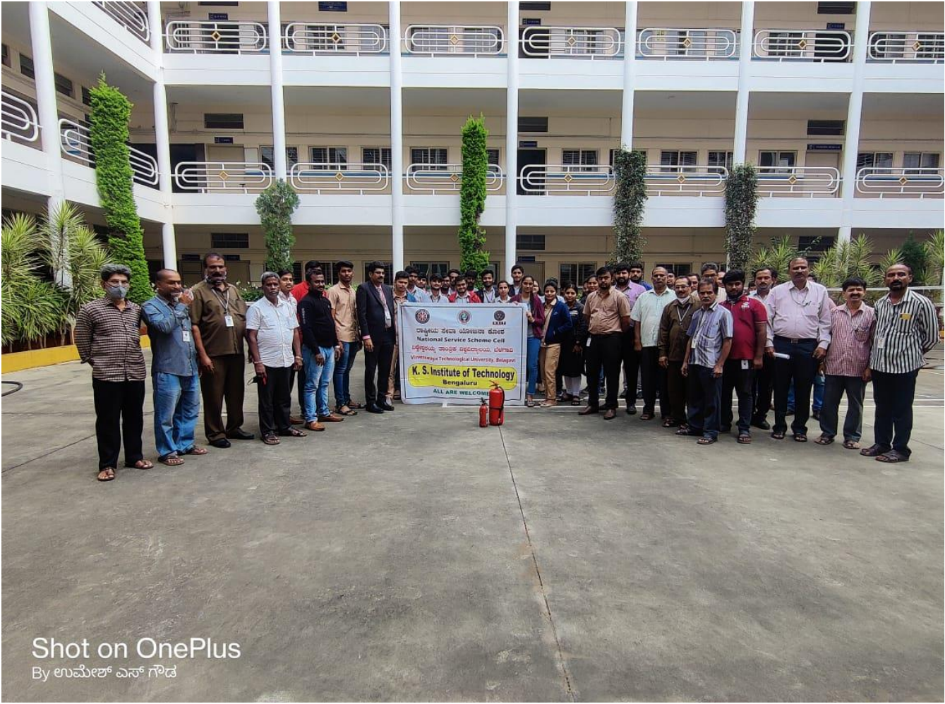
Group Photo of Dignitaries along with the NSS volunteers