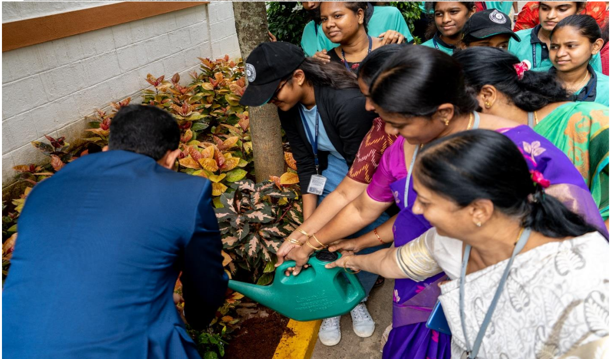
PRINCIPAL AND STAFF PLANTING SAPPLINGS