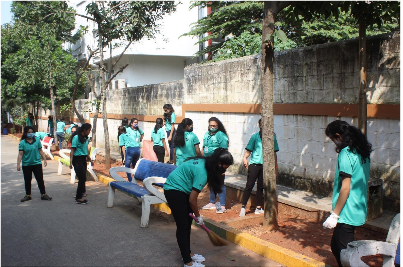
Photo of volunteers cleaning the footpath