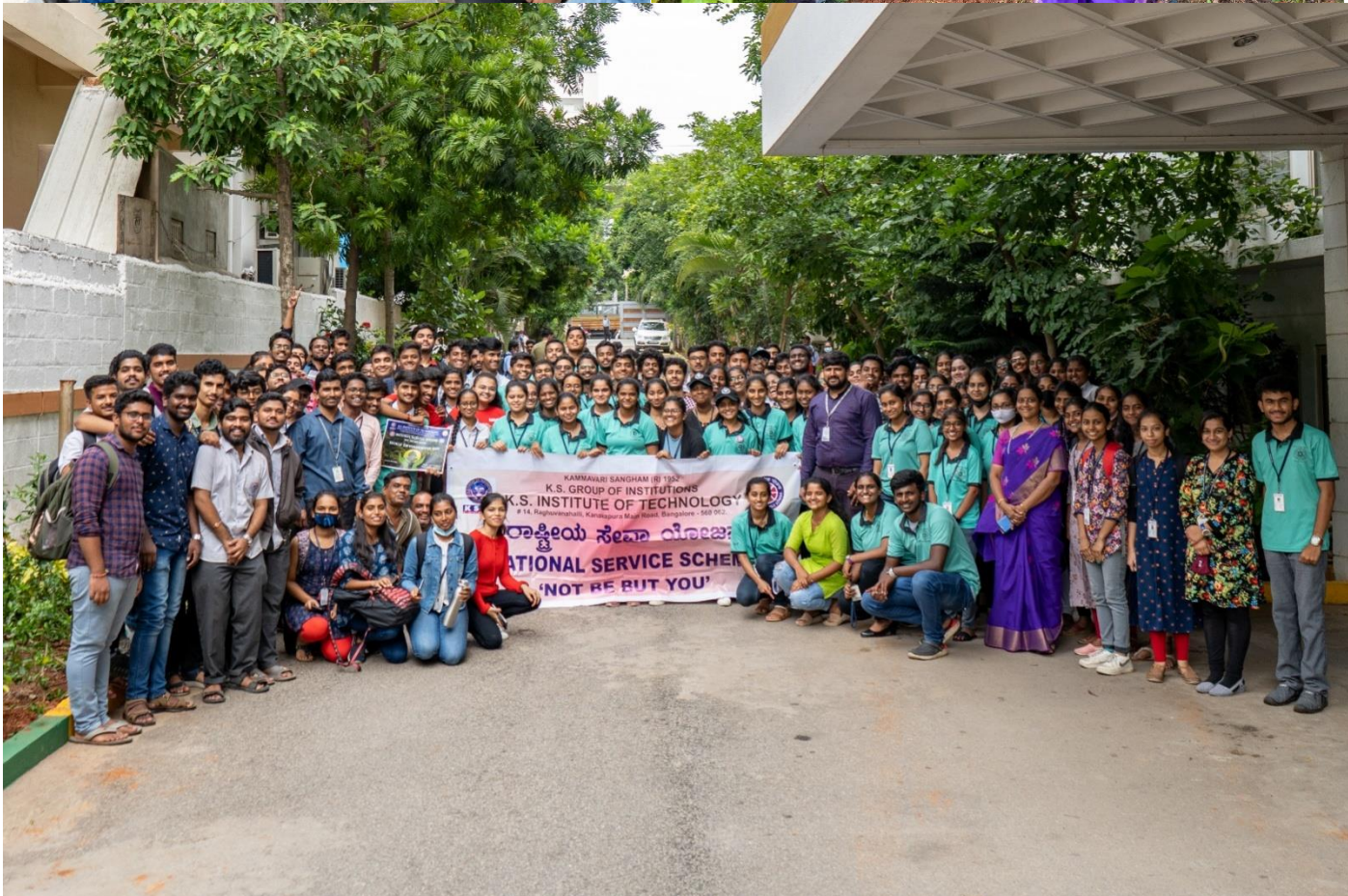
NSS UNIT CELEBRATING ENVIRONMENTAL DAY