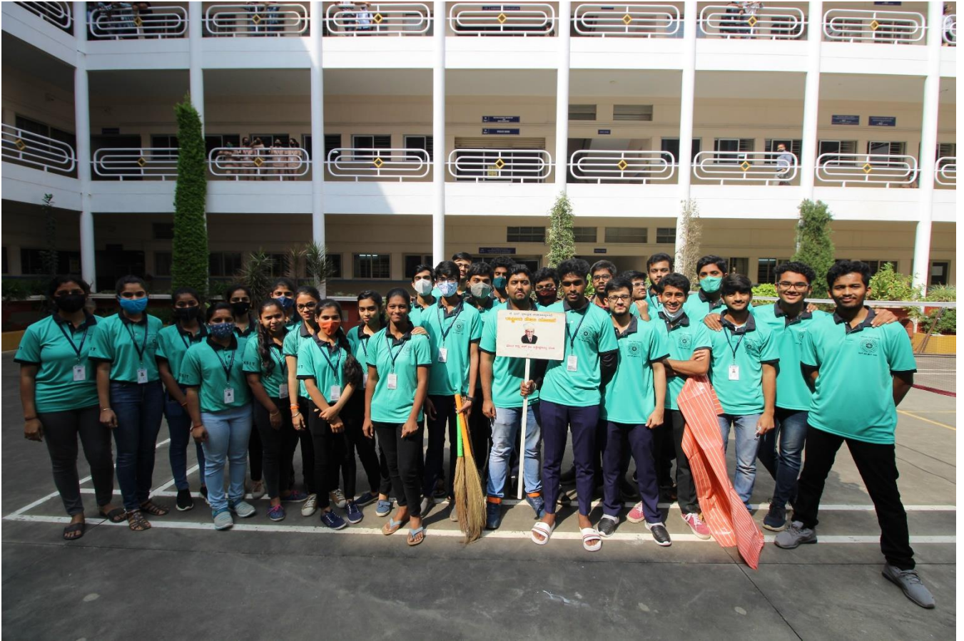
Group photo of team Vishveshwaraya