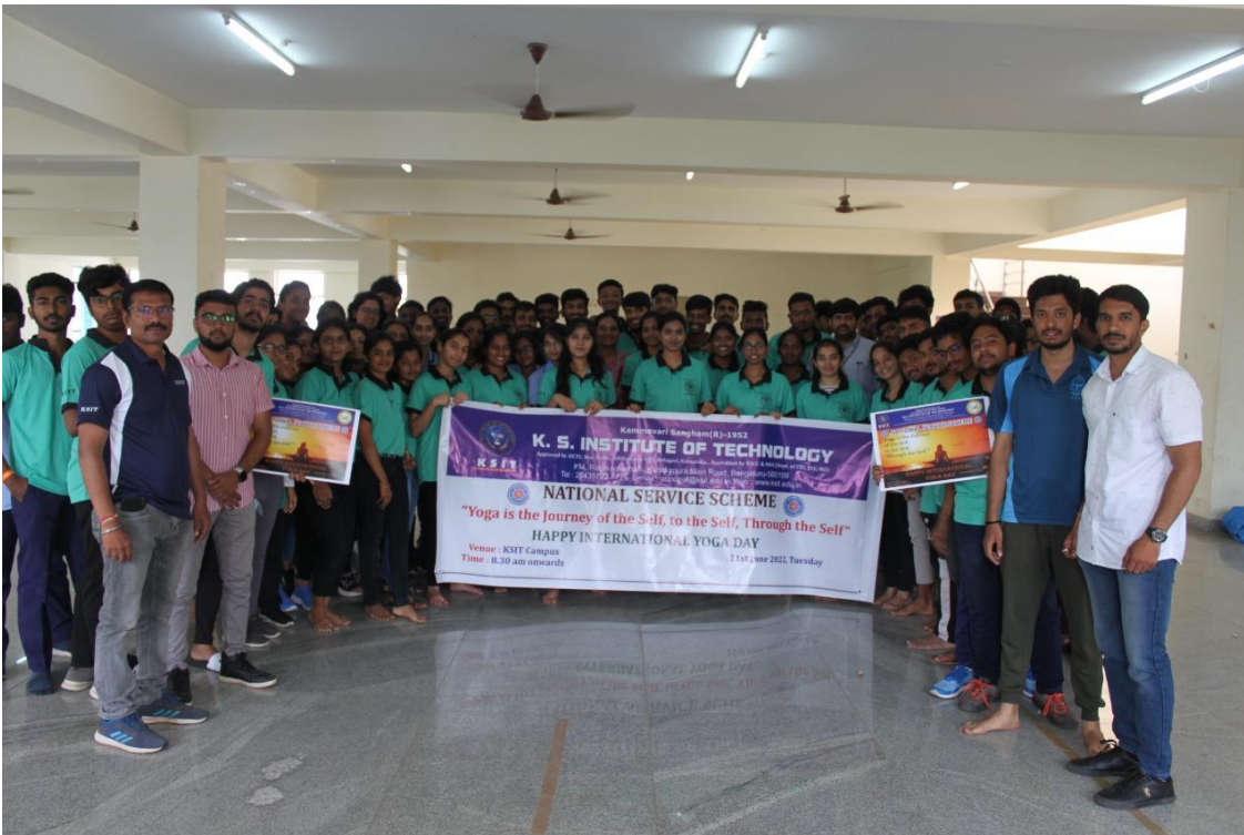
NSS VOLUNTEERS of KSIT