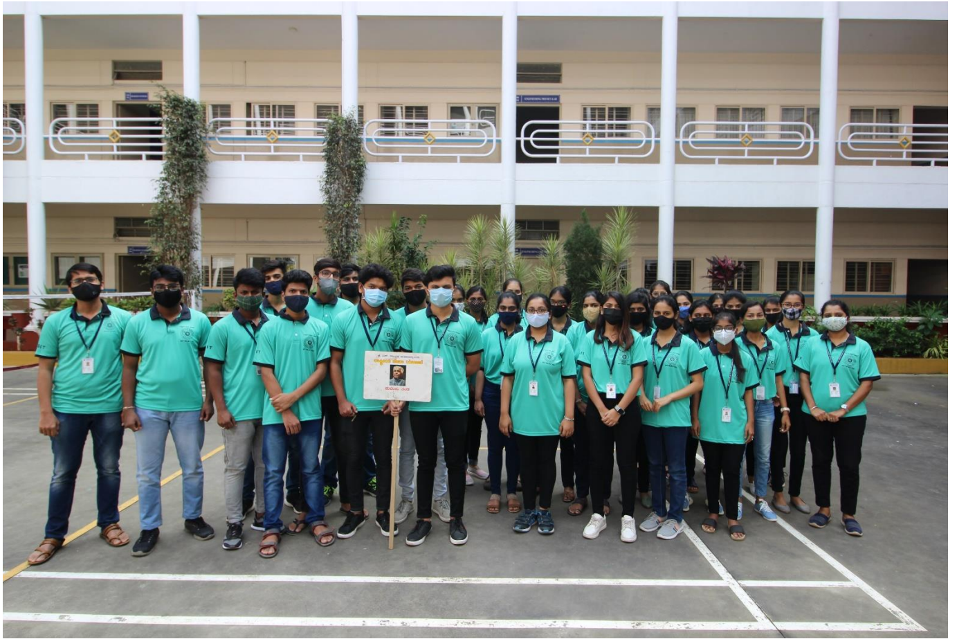
Group photo of team Kuvempu