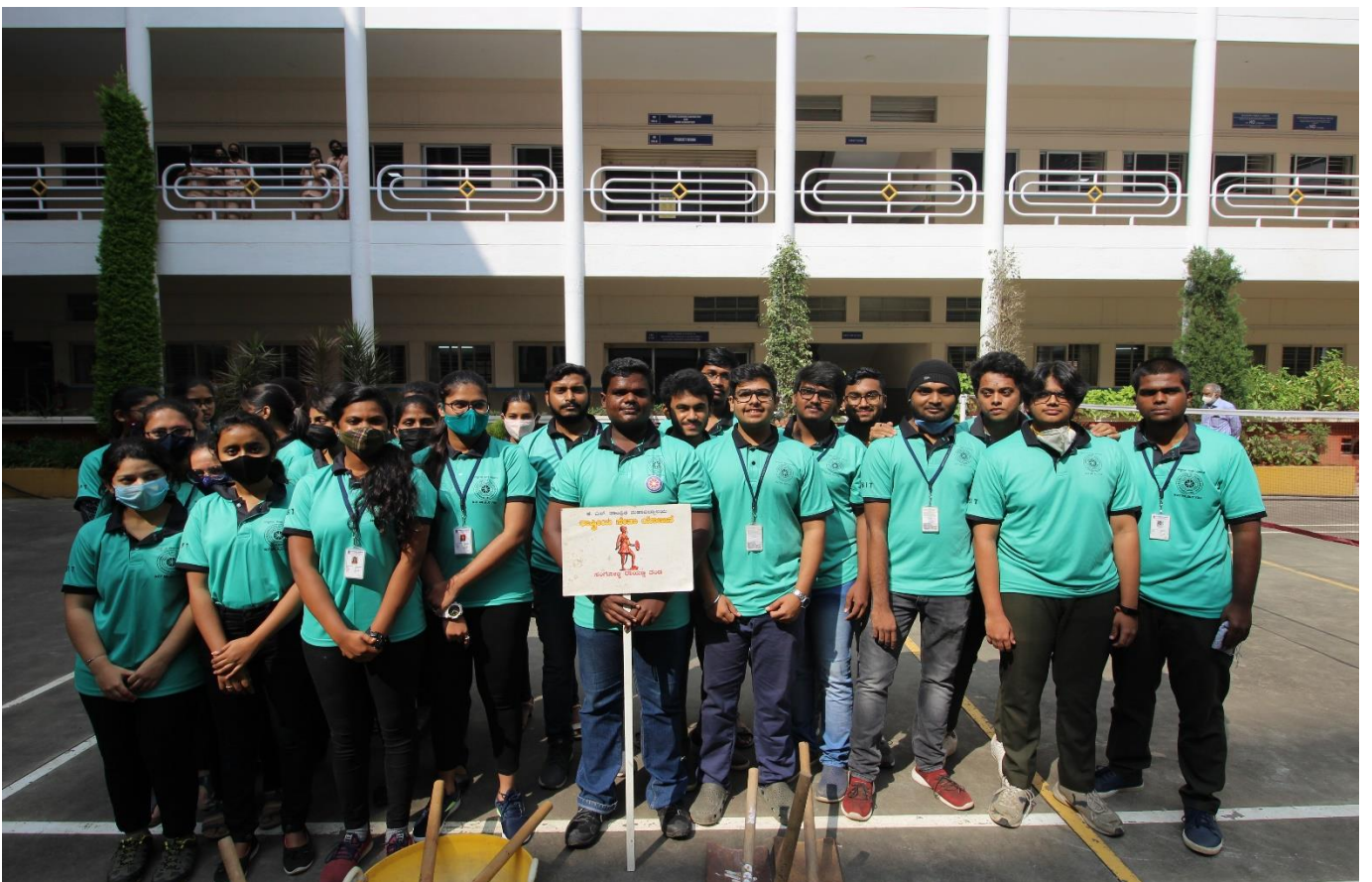
Group photo of team Sangolli Rayanna