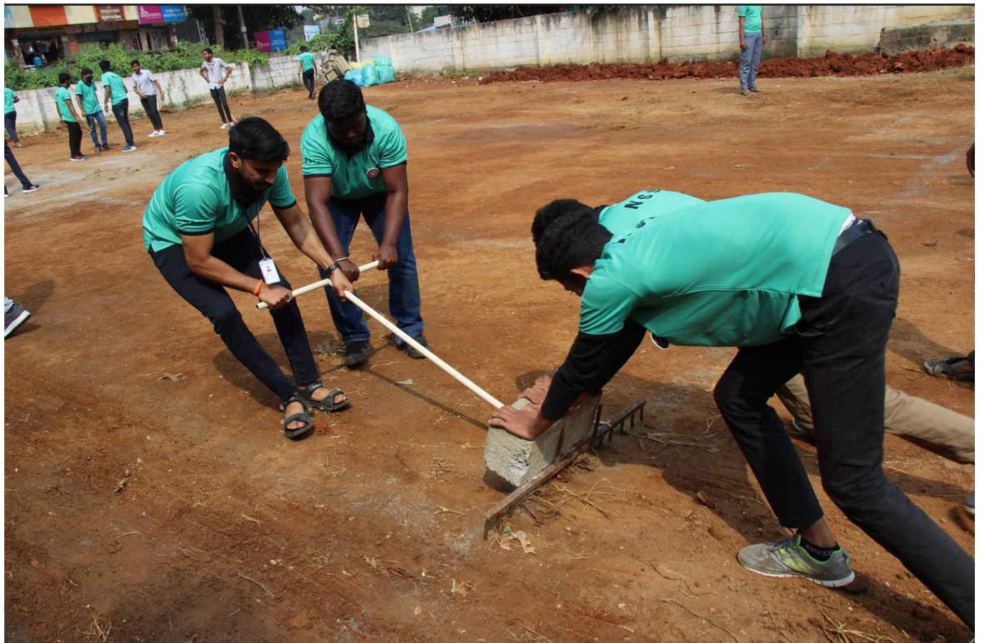
Photo of volunteers cleaning the ground