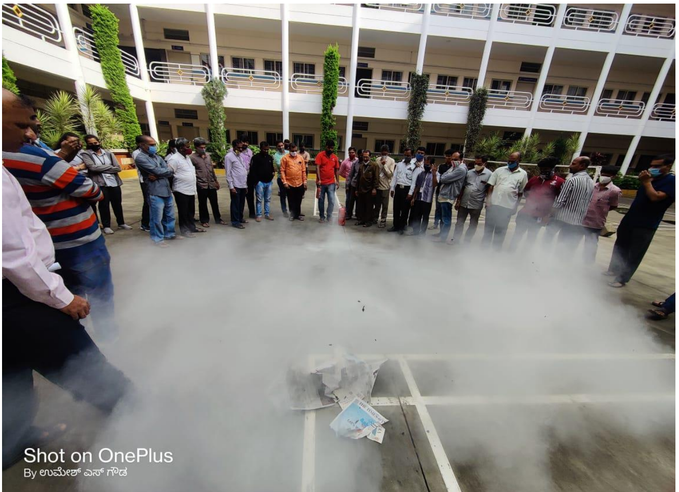
Live Demonstration of the usage of fire extinguisher