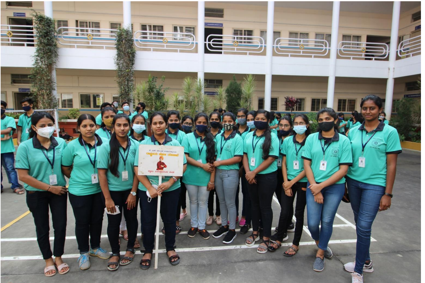
Group photo of team Swami Vivekananda