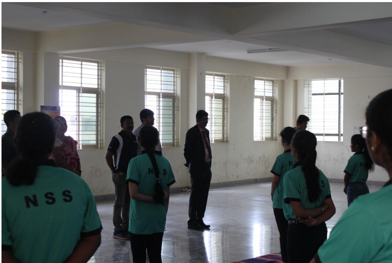
Principle inaugurating the session