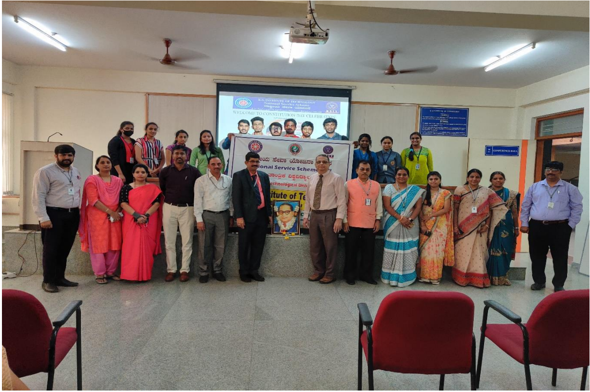
Group photo of the Dignitaries along with the NSS volunteers