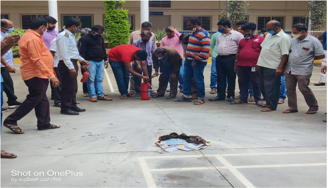
Addressing the usage about the fire extinguisher