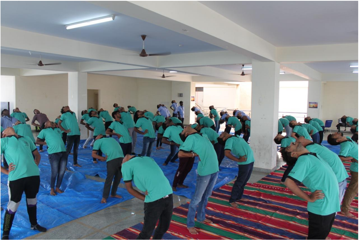
Yoga by NSS volunteers