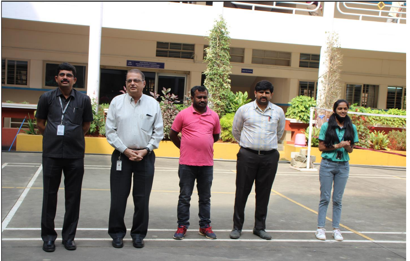
Inauguration by Dignitaries