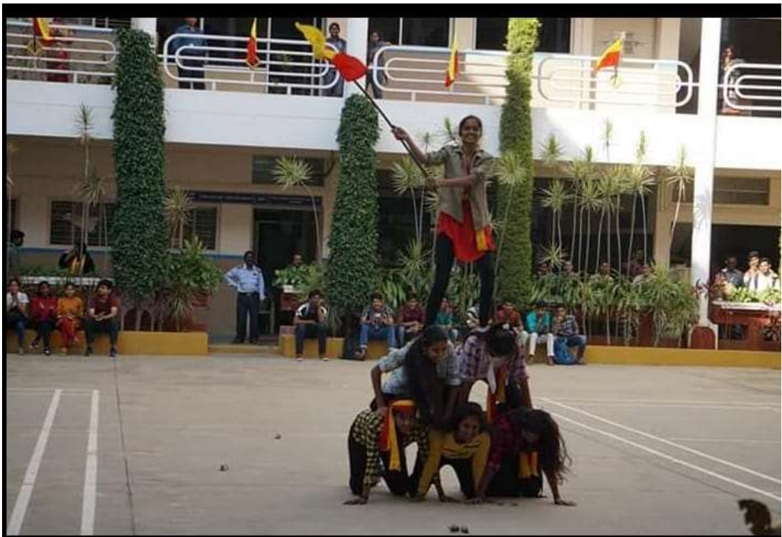
COMPUTER SCIENCE AND ENGINEERING:DANCE(V SEM)