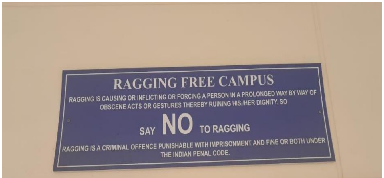
Fig 2. Ragging Free Campus Display boards