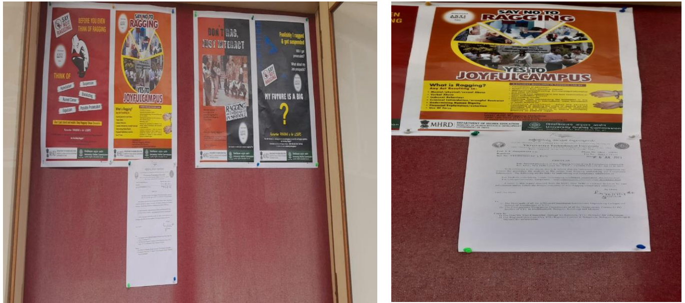
Fig 1. Ragging related Posters, Circulars which are related punishments for Ragging & Harassment displayed on notice board