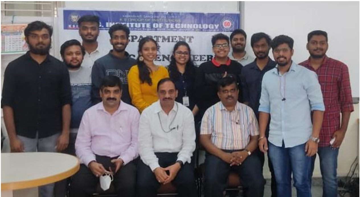
Student Volunteers from various branches of KSIT on the day of the event