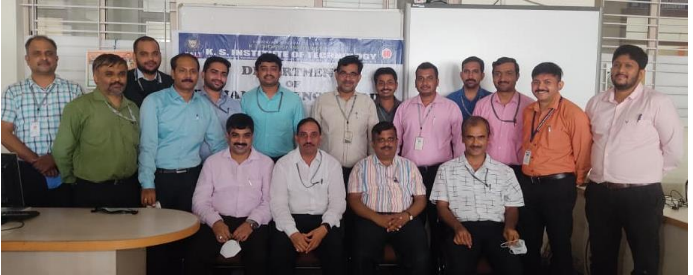
Staff of Mechanical Engineering Department on the day of the event