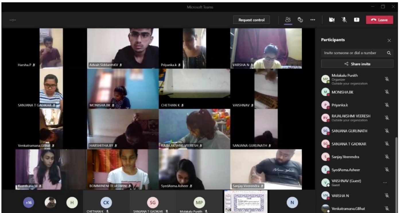
Students participating in the event 2.0