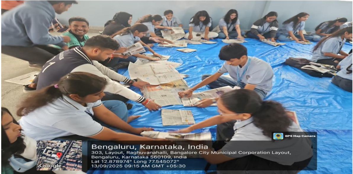
Bengaluru, Karnataka, India 303, Layout, Raghuvanahalli, Bangalore City Municipal Corporation Layout, Bengaluru, Karnataka 560109, India Lat 12.878974° Long 77.545072° 13/09/2025 09:15 AM GMT +05:30