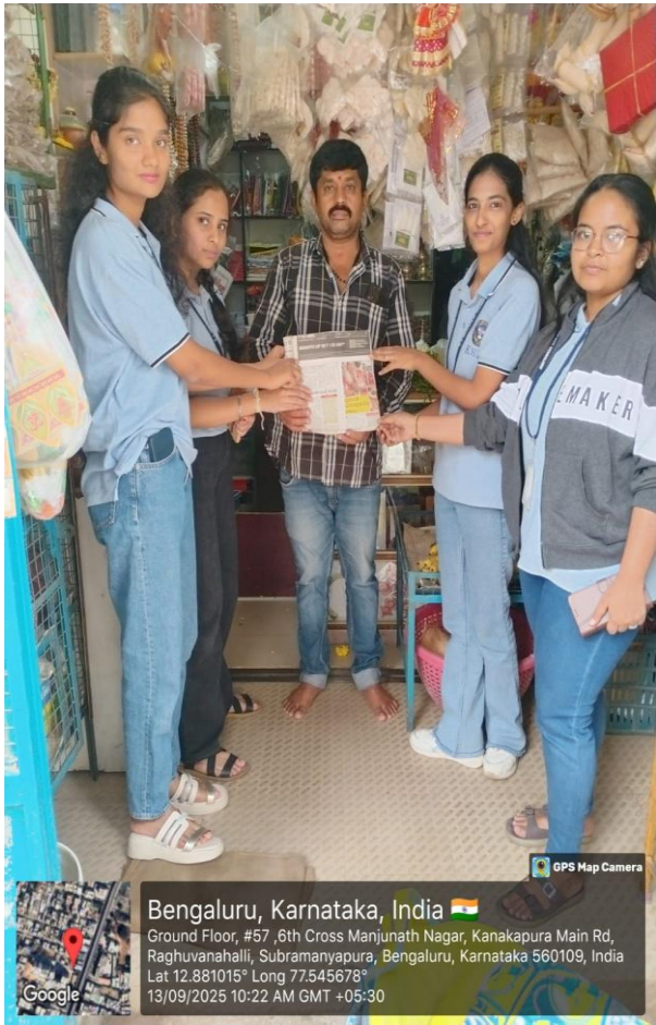
Bengaluru, Karnataka, India Ground Floor, #57, 6th Cross Manjunath Nagar, Kanakapura Main Rd, Raghuvanahalli, Subramanyapura, Bengaluru, Karnataka 560109, India Lat 12.881015° Long 77.545678° 13/09/2025 10:22 AM GMT +05:30