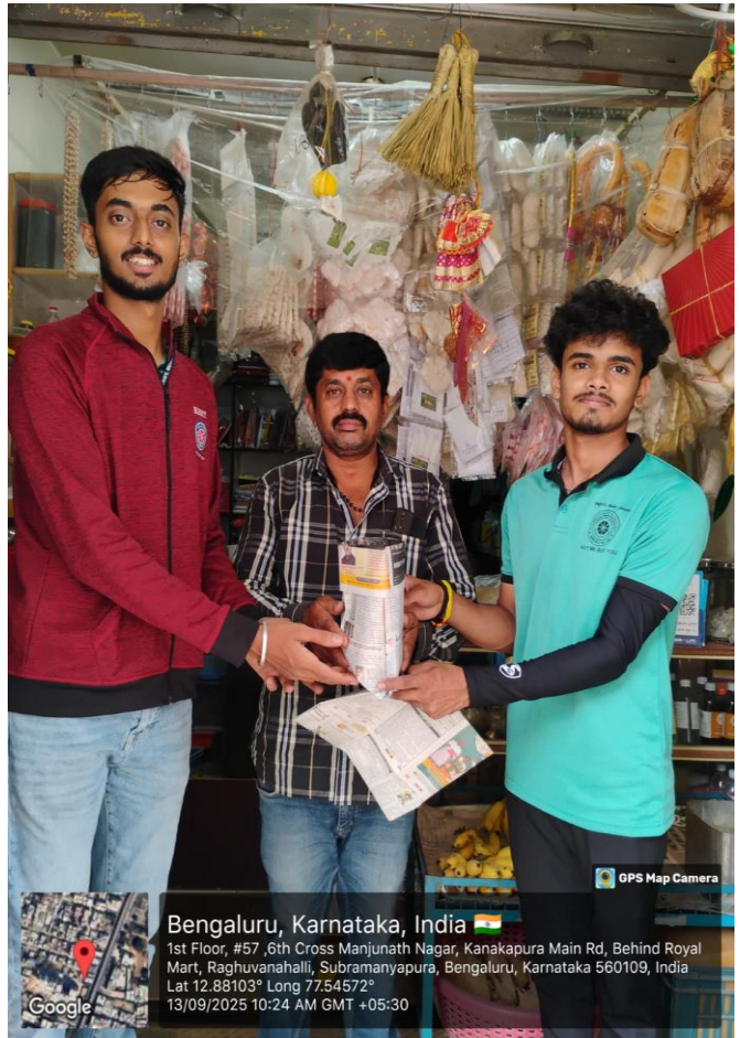
Bengaluru, Karnataka, India 1st Floor, #57, 6th Cross Manjunath Nagar, Kanakapura Main Rd, Behind Royal Mart, Raghuvanahalli, Subramanyapura, Bengaluru, Karnataka 560109, India Lat 12.88103° Long 77.54572° 13/09/2025 10:24 AM GMT +05:30