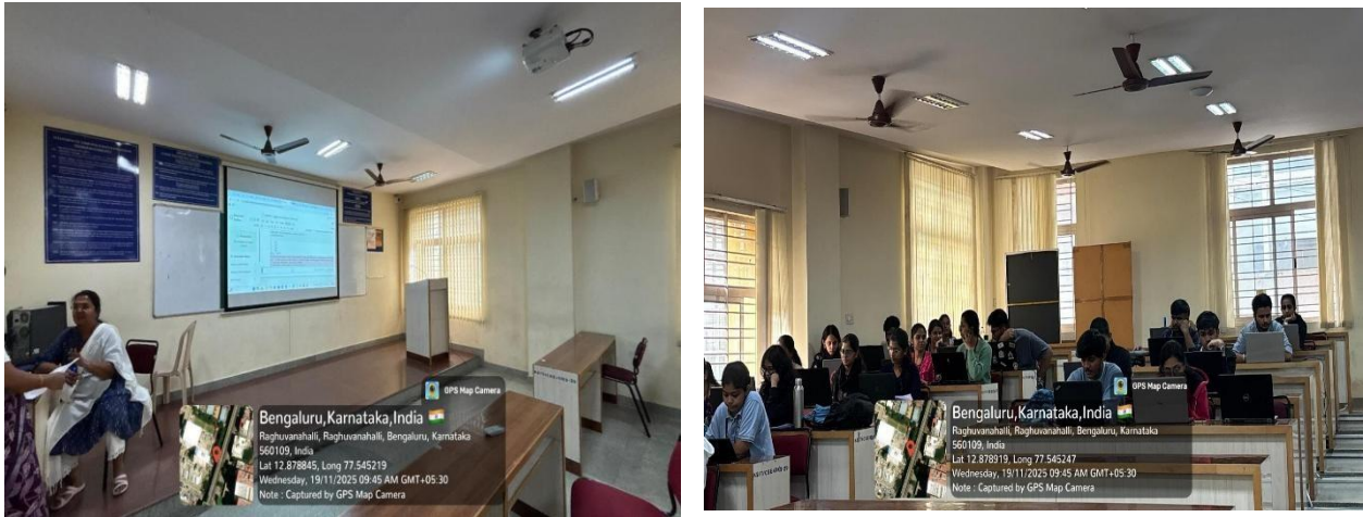
Fig 3.1: Session 1 Creating Data Frames using panda and MatPlotLib