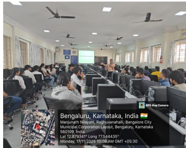
Fig 1.1: Welcome speech and Session1