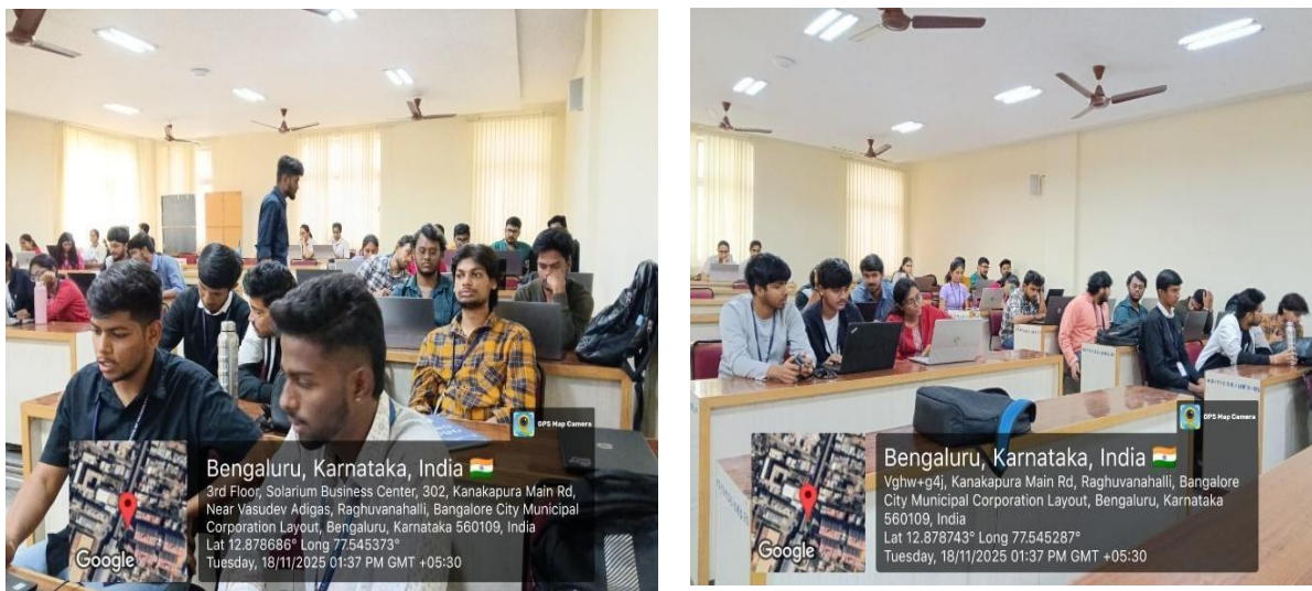
Fig 2.2: Session 2 Creating Data Frames

This session demonstrates different methods of creating and manipulating pandas Data Frames using tuples, NumPy arrays, and Python dictionaries. It showcases how raw data—whether stored in lists of tuples, NumPy arrays, or key-value pairs—can be structured into a tabular format using pandas. Additionally, the code illustrates essential Data Frame operations, including selecting single and multiple columns to access specific subsets of data for analysis.