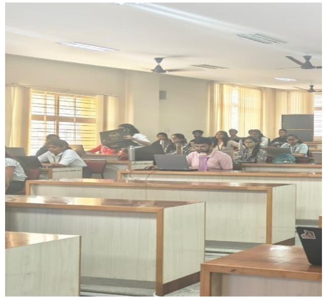
Fig 4.1: Session 1 Practical session on Panda, Matplotlib, Seaborn, and Scikit-learn