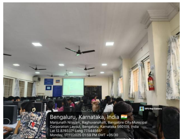
Fig 1.2: Welcome speech and Session1