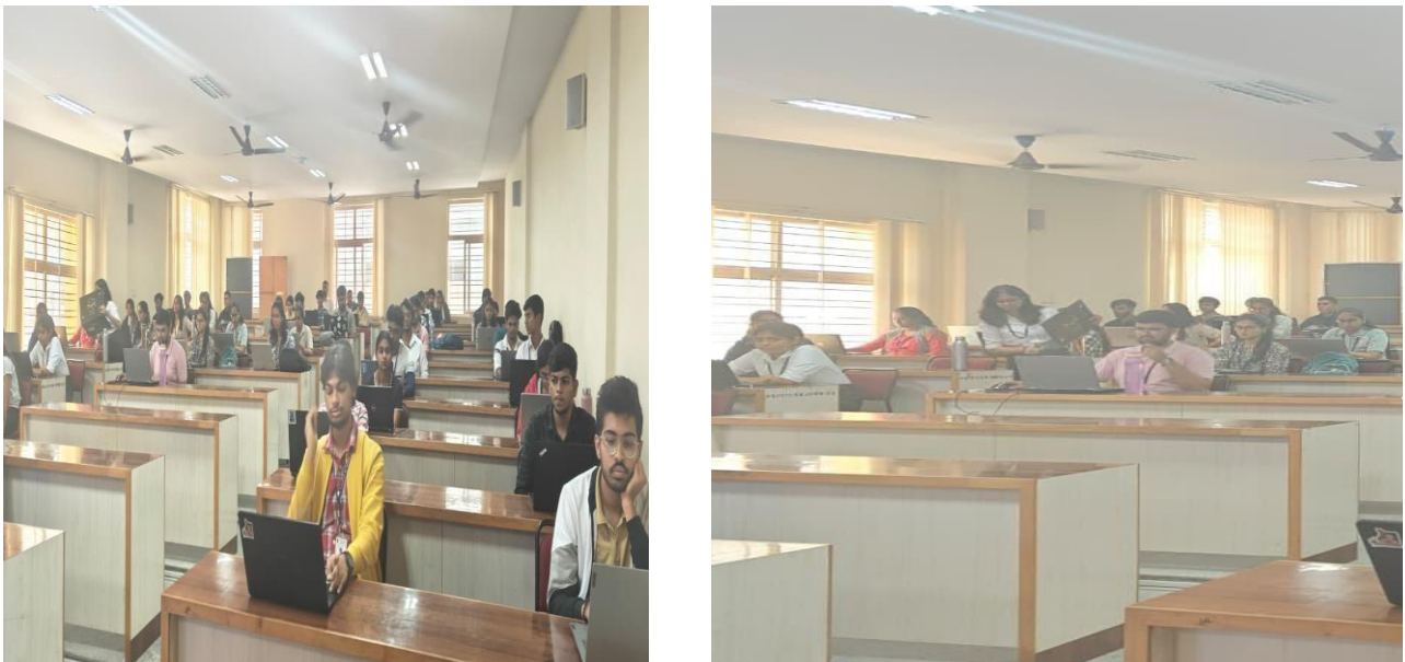
Fig 3.2: Session 2 Creating Data Frames using panda

The session explained about data preparation, exploratory data analysis (EDA), visualisation using Matplotlib and Seaborn, basic statistical summaries and outlier detection, simple time-series operations, data merging/aggregation, and an introductory linear regression exercise