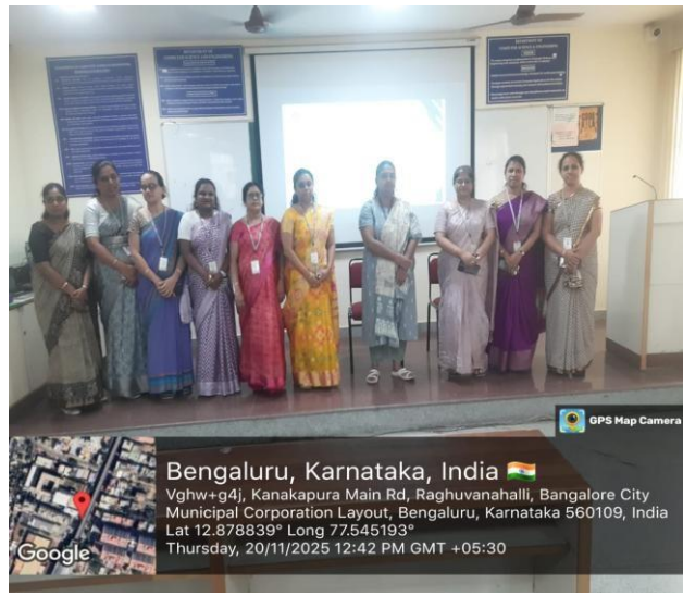
Fig 4.2: Session 2 Valedictory Photos