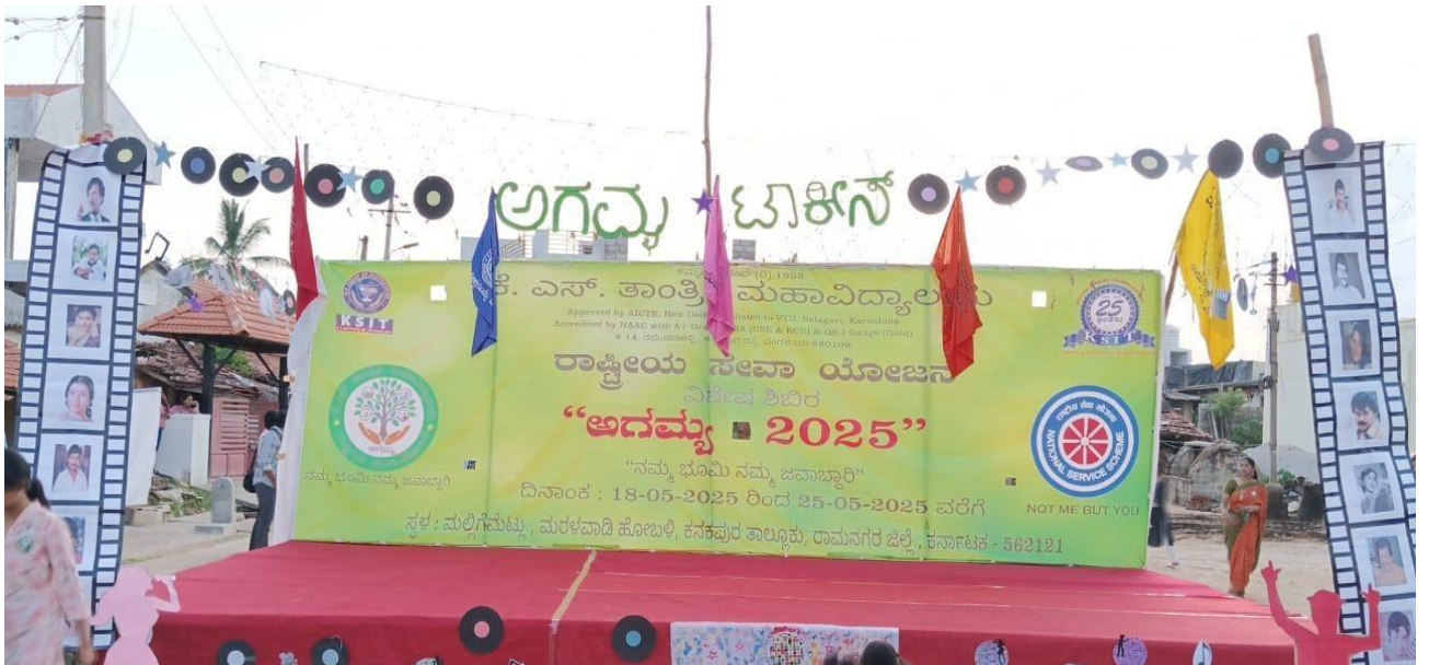
The stage was decorated in a film theme.