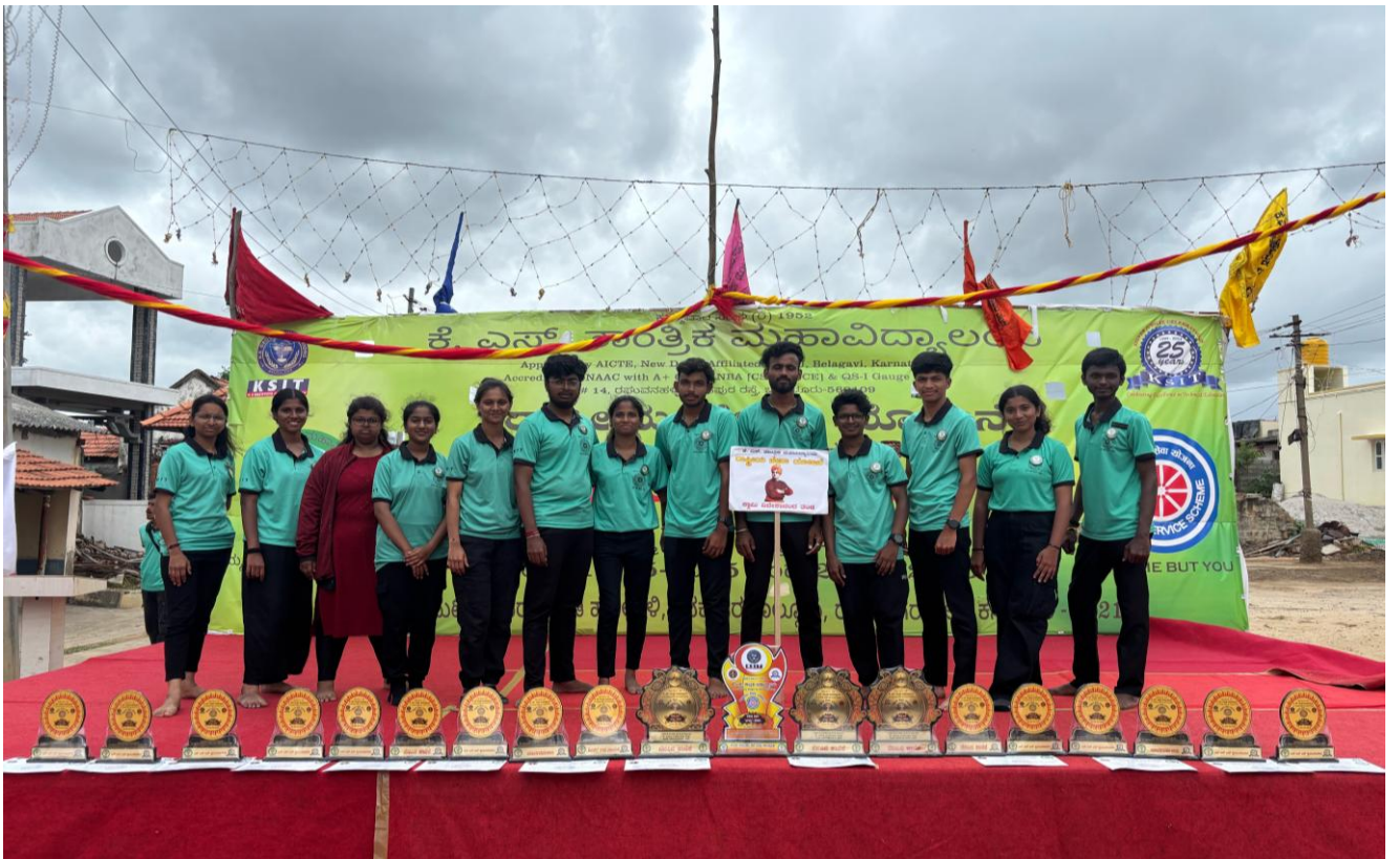
Team Swami Vivekananda - Award for Exemplary Discipline