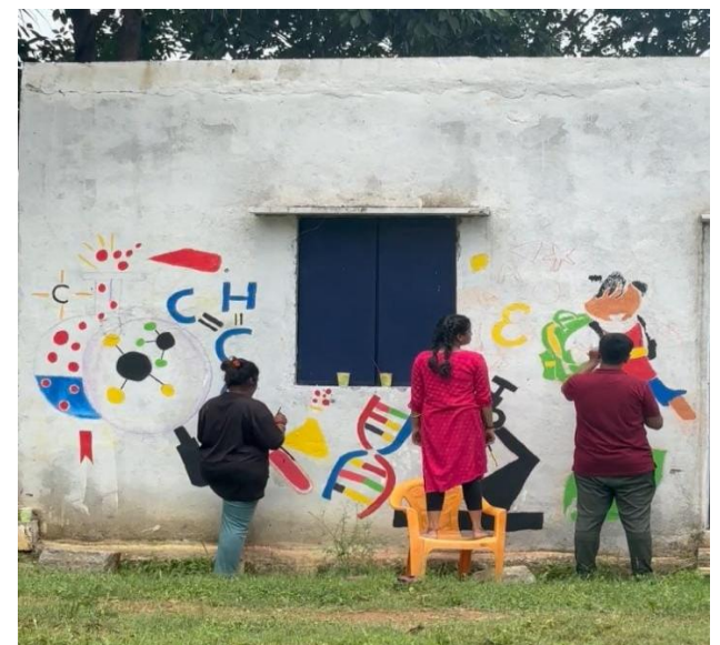
Painting Outerwalls of Government School, Malligemettilu