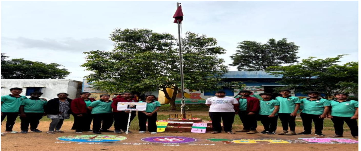
Flag hoisting by team Kuvempu