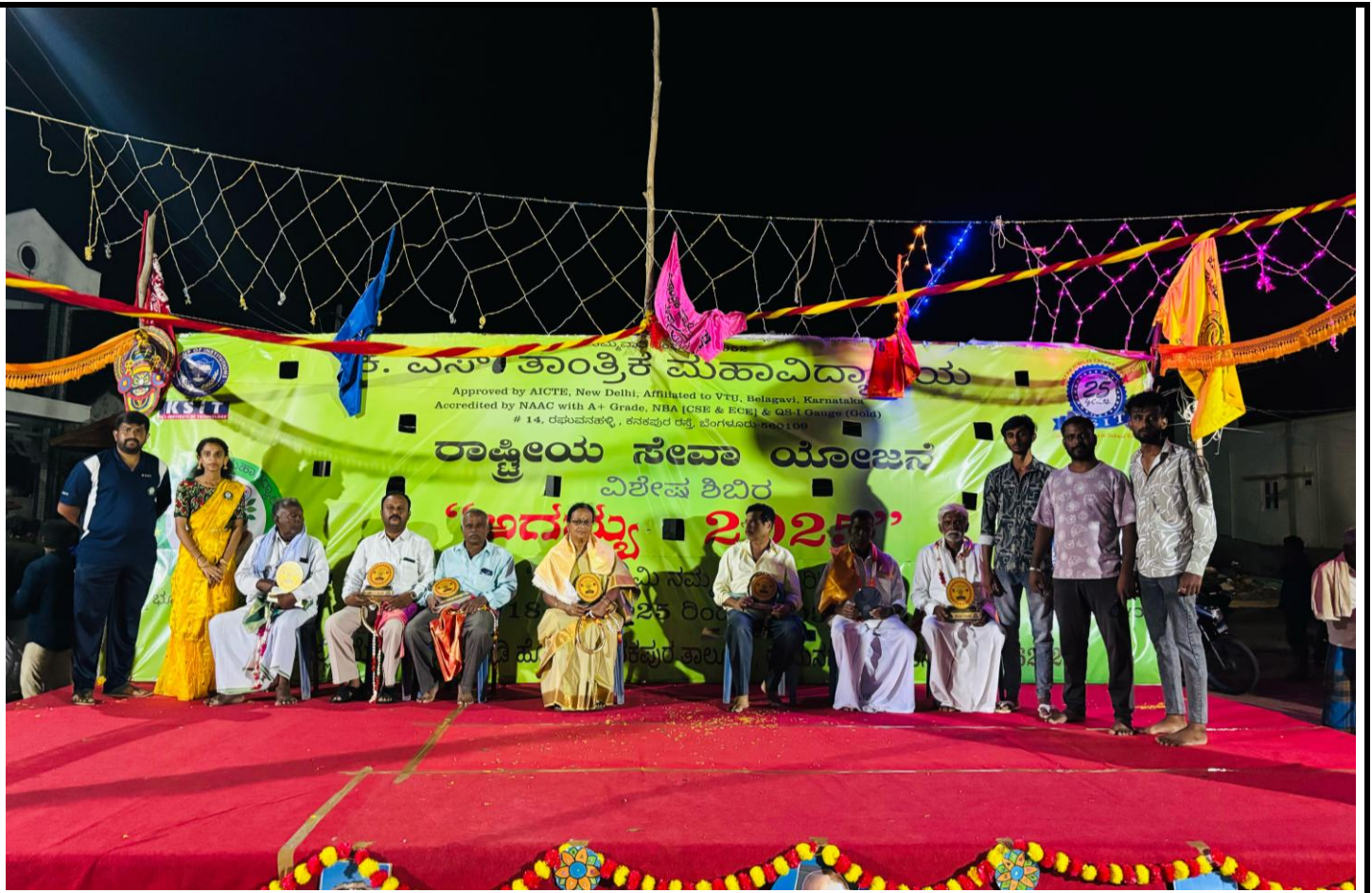
Felicitating cultural's guest