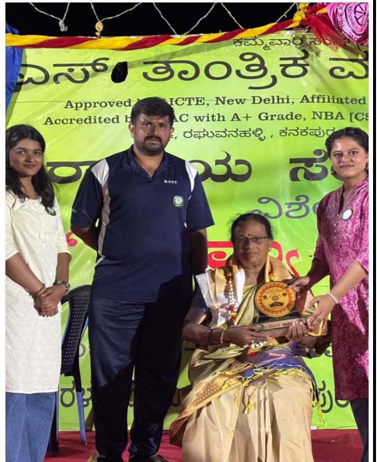
Felicitating cultural's guest