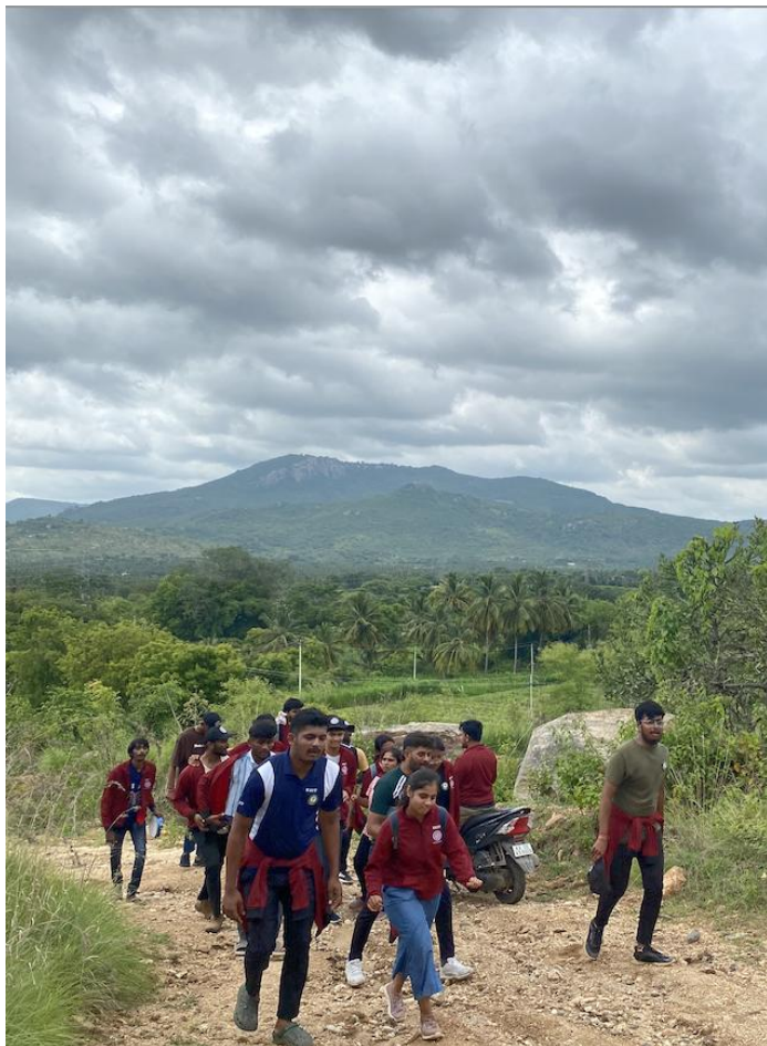
Through the hill trails