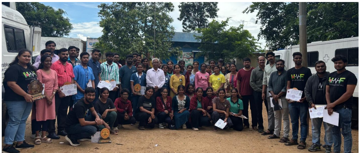
Felicitation to doctors.