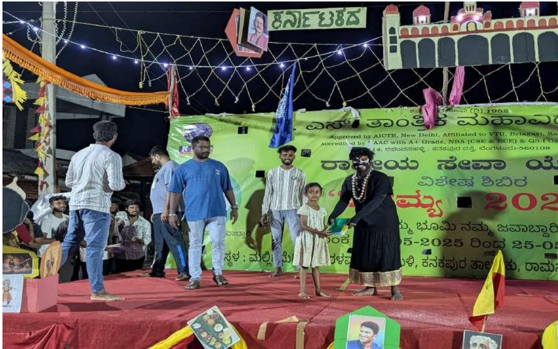
Books distribution for Children