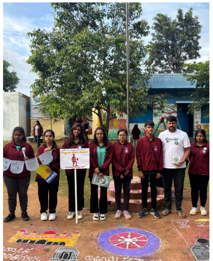
Flag hoisting by team Sangolli Rayanna