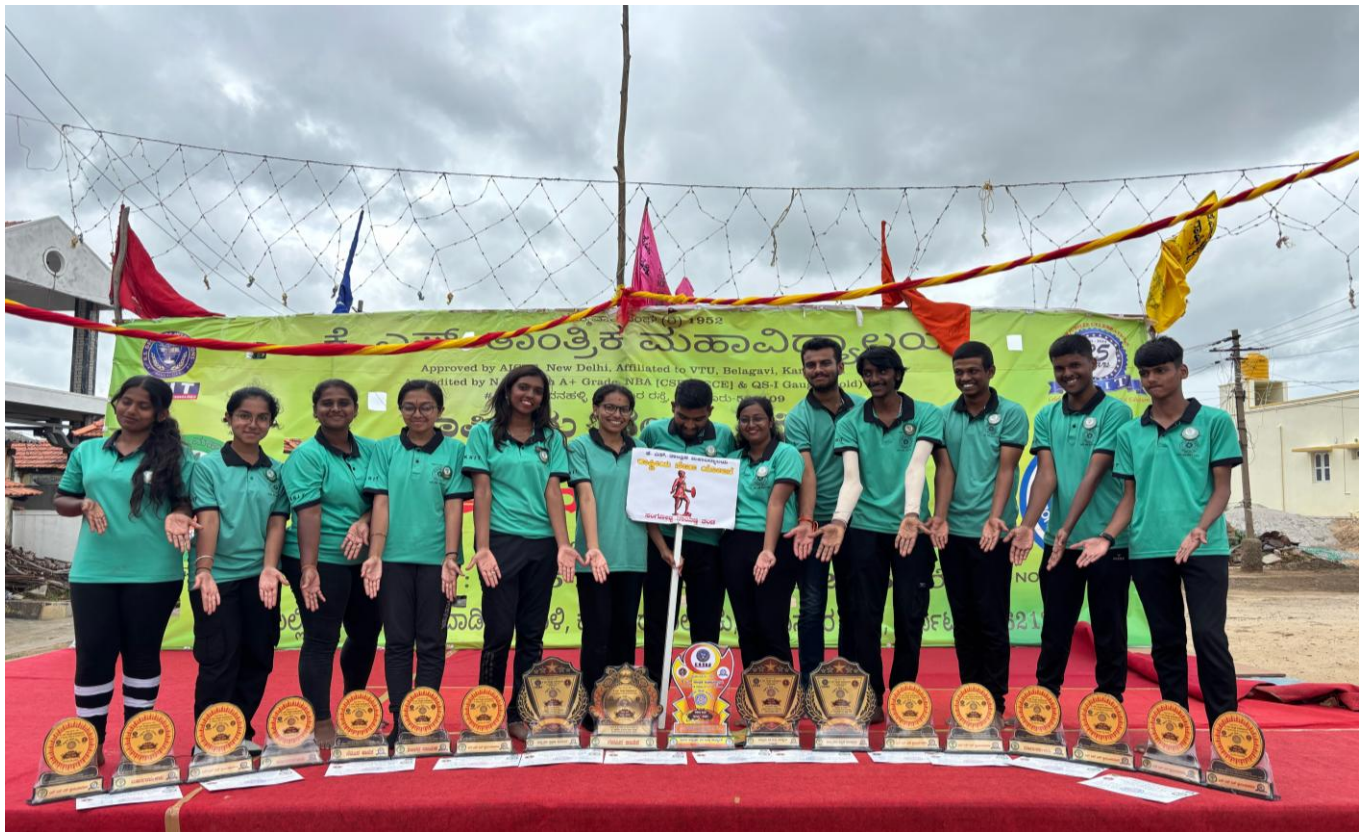
Team Sangolli Rayanna - Best Cultural Performance Award