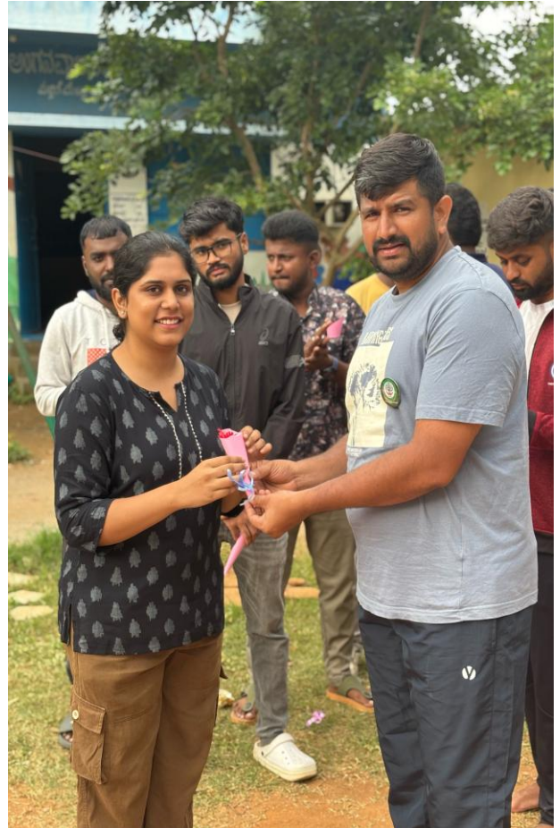
Felicitating flag hoisting guest