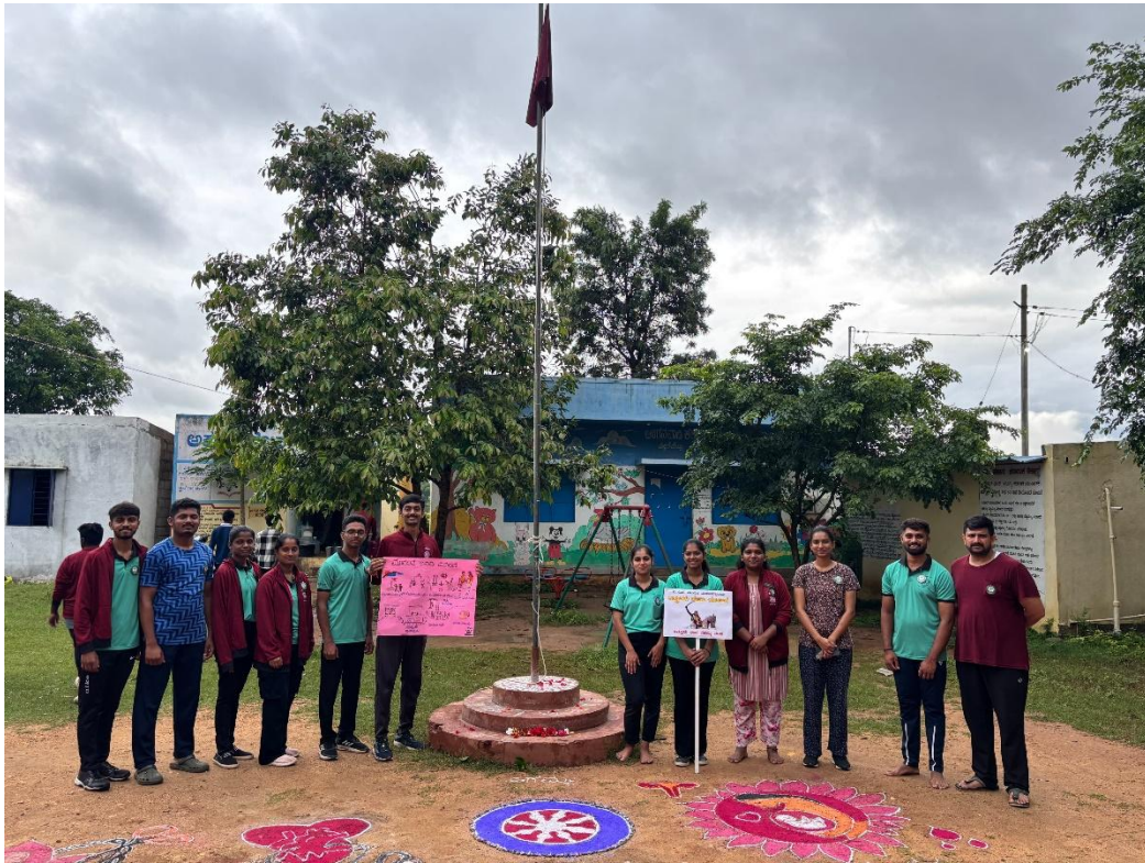
Flag hoisting by team Kitturu rani chennamma