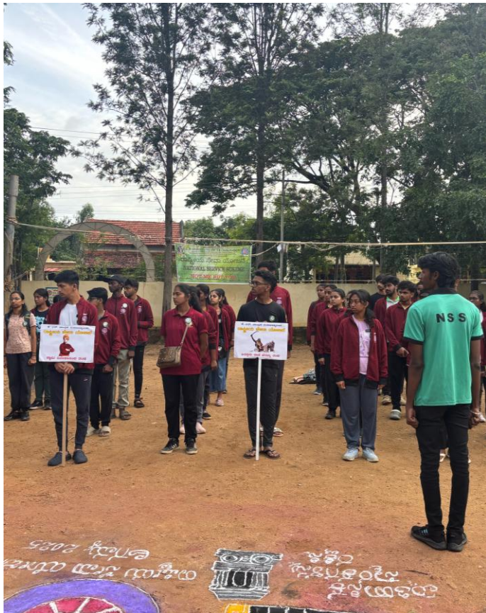
Teams assembled for flag hoisting