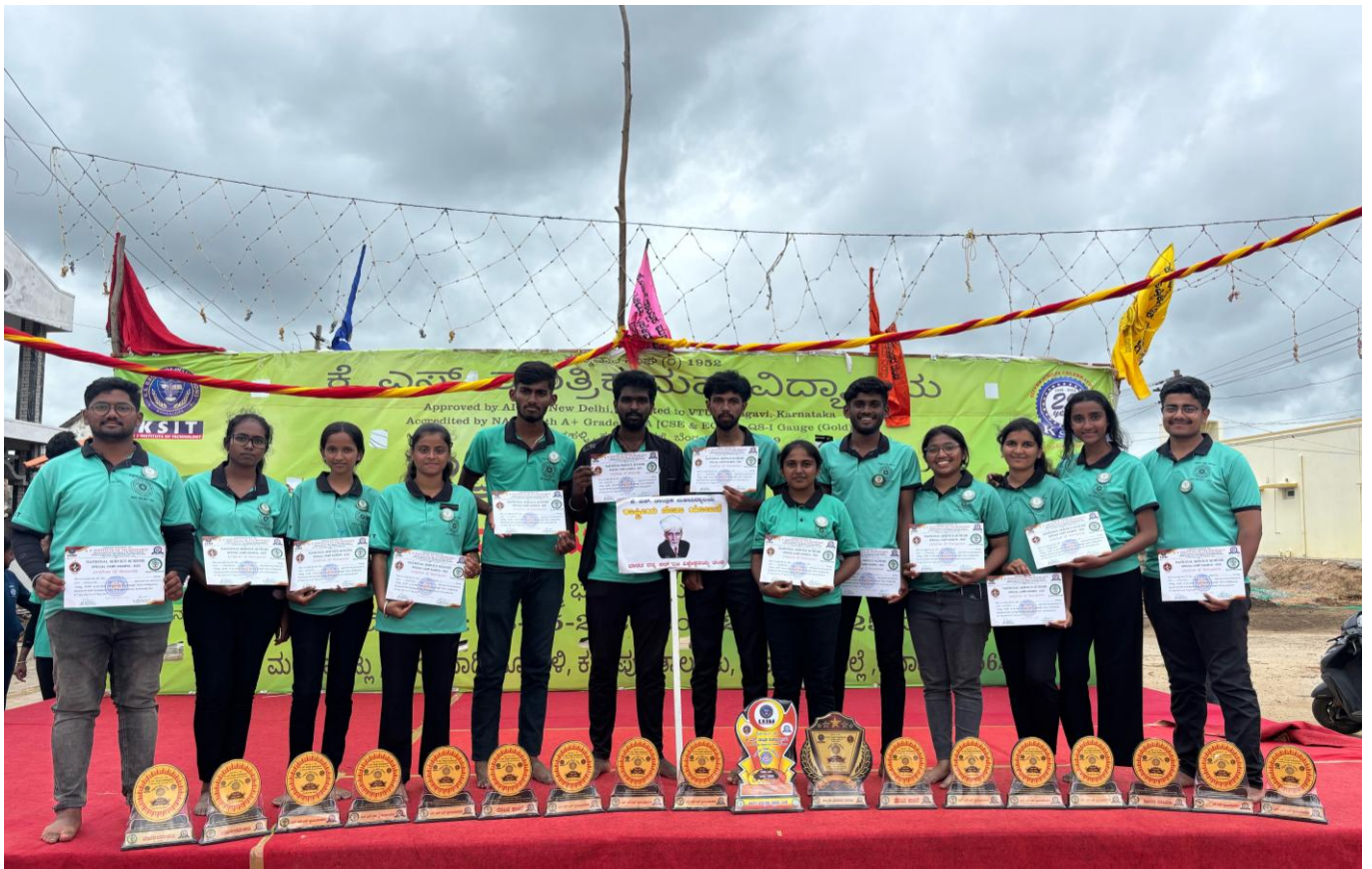
Team Sir M Visvesvaraya - Award for Creative Stage Them