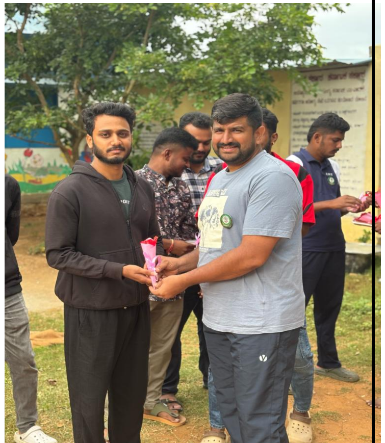
Felicitating flag hoisting guest