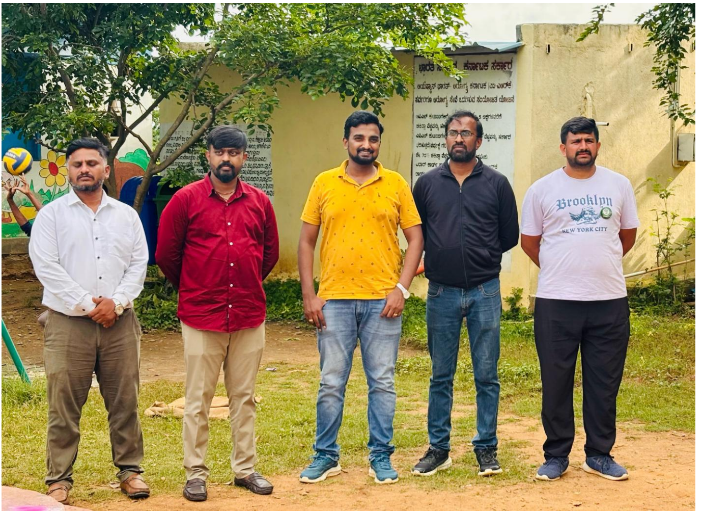
Flag dehoisting guests (Faculties of CSE-dept)