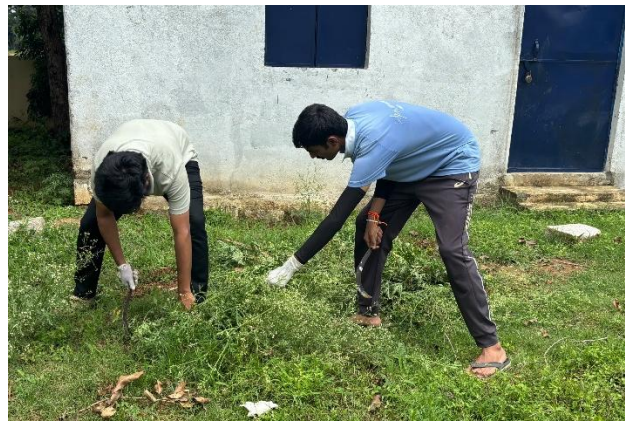
Cleaning the school premises.