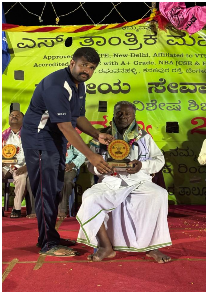
Felicitating cultural's guest