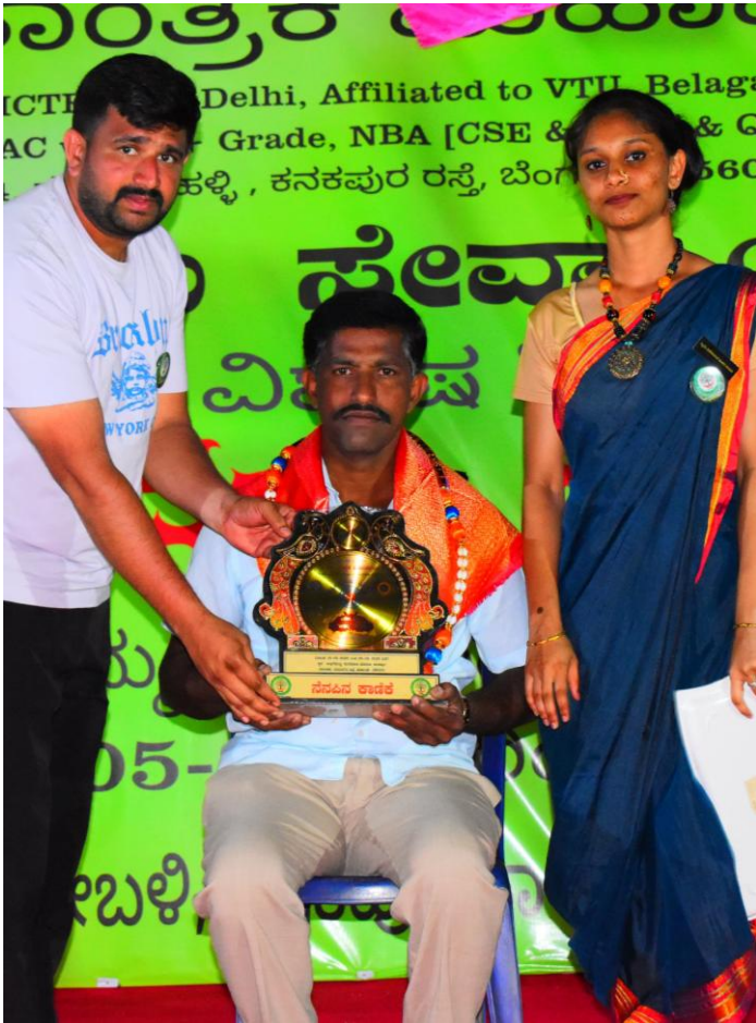
Felicitating cultural's guest