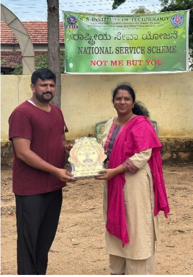
Felicitating flag de-hoisting guest.