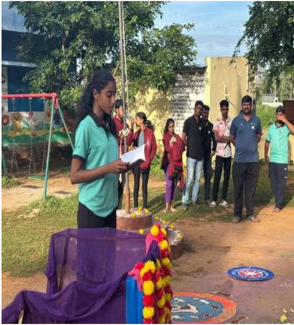
Flag hoisting speech