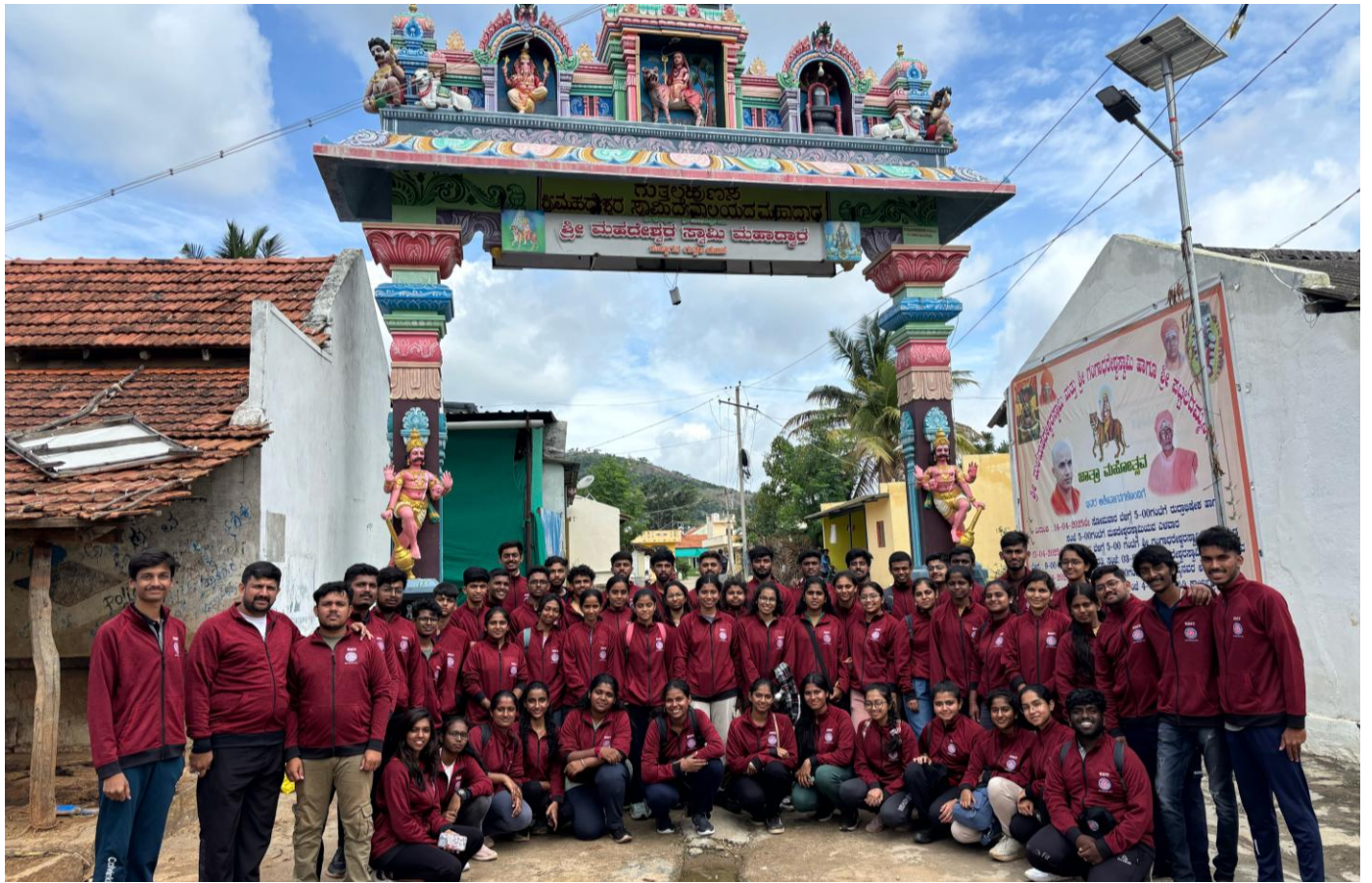
Trekking at Sri Mahadeshwara Swami Betta