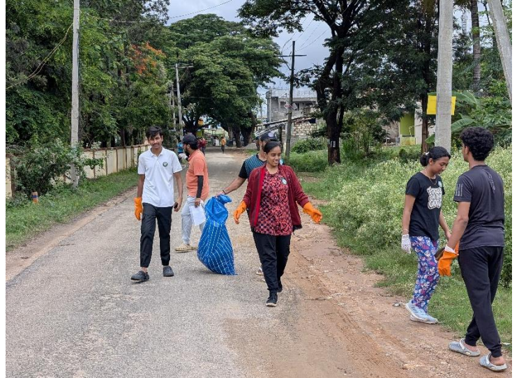
Collecting Plastic and Spreading Awareness