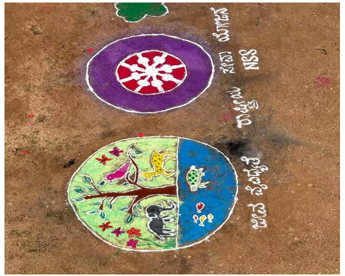
Biodiversity in Living Organisms