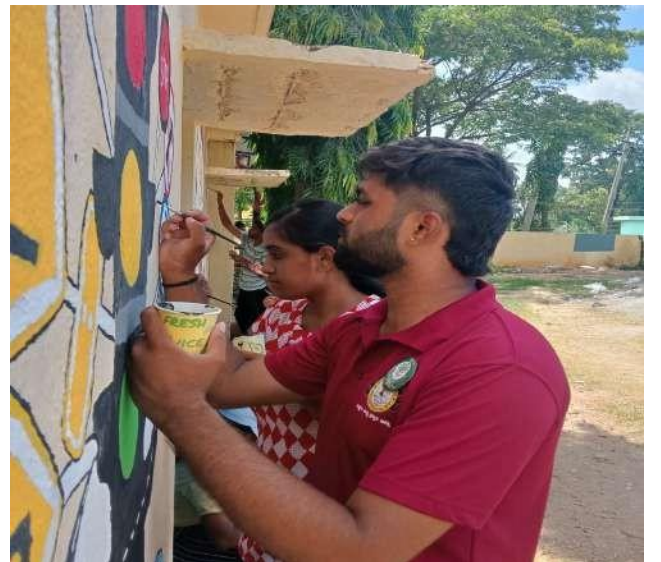
NSS Volunteers painting the walls of Government School, Malligemetlu