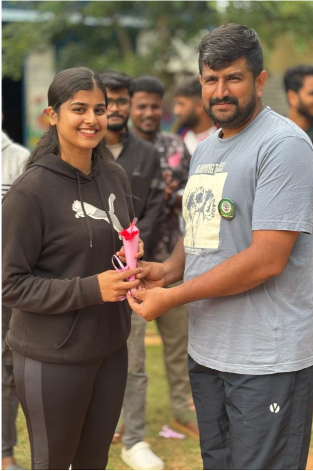
Felicitating flag hoisting guest