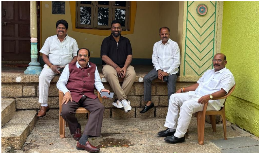
Chief guests for inauguration of camp.