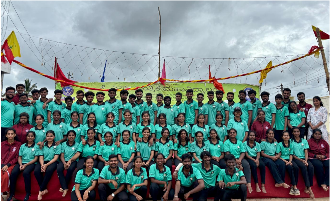
Agamyia 2025 volunteers