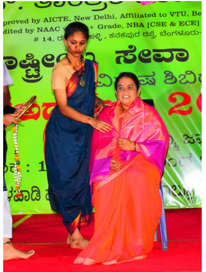
Felicitating cultural's guest