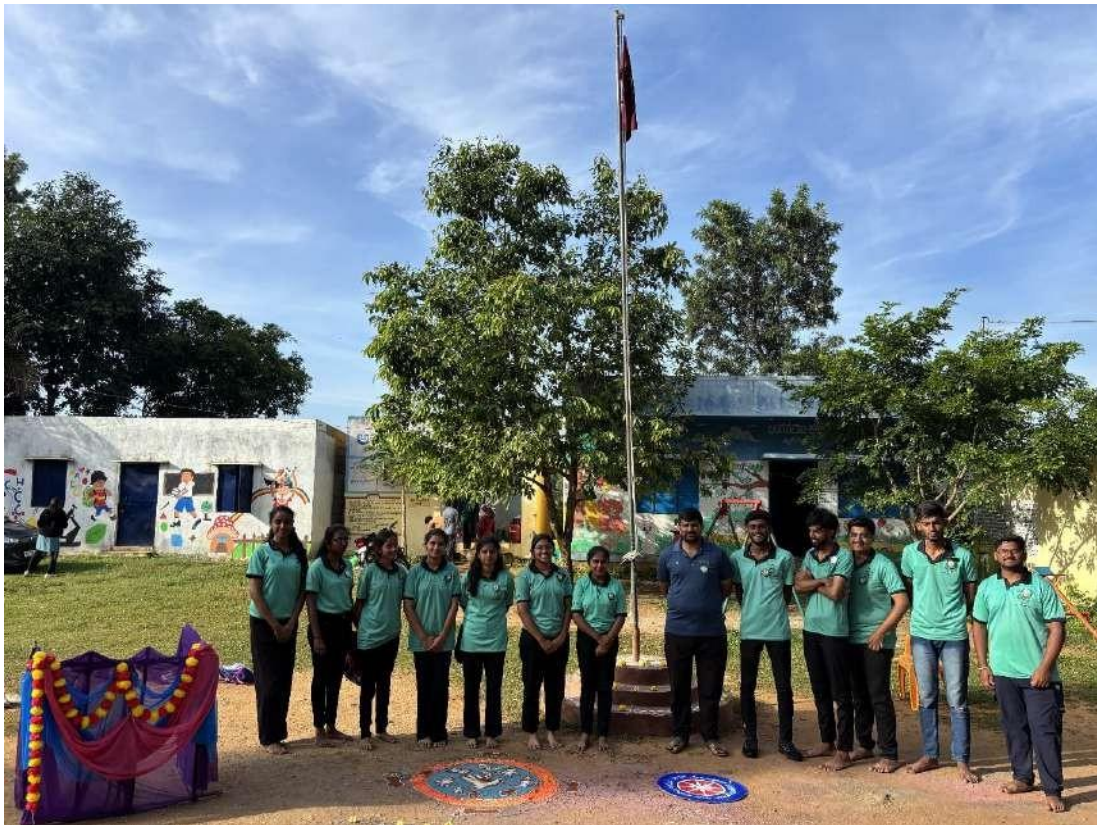
Flag hoisting by team Sir M Visvesvaraya