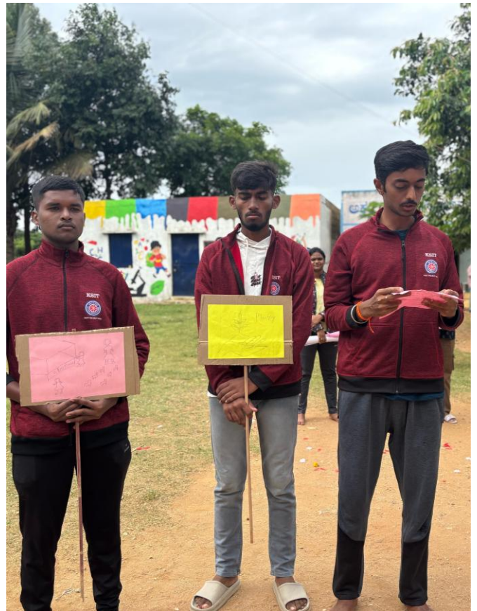
Awareness speech during Flag hoisting