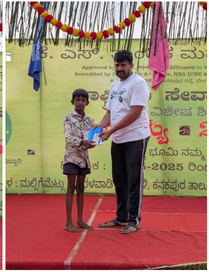
Books distribution for kids.