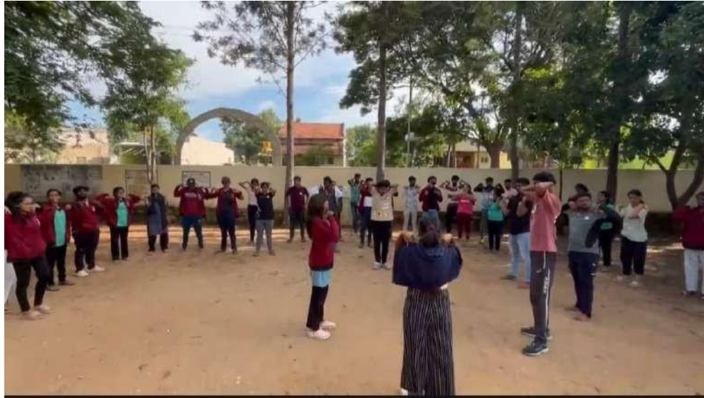
Zumba dance morning fitness exercise