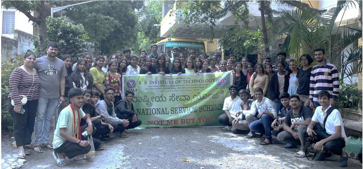
Volunteers setting out for the NSS Special Camp.