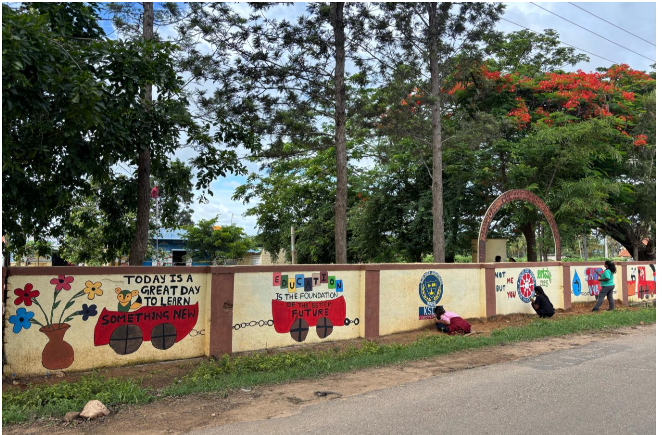
Painting the walls of Government school, Malligemetlu