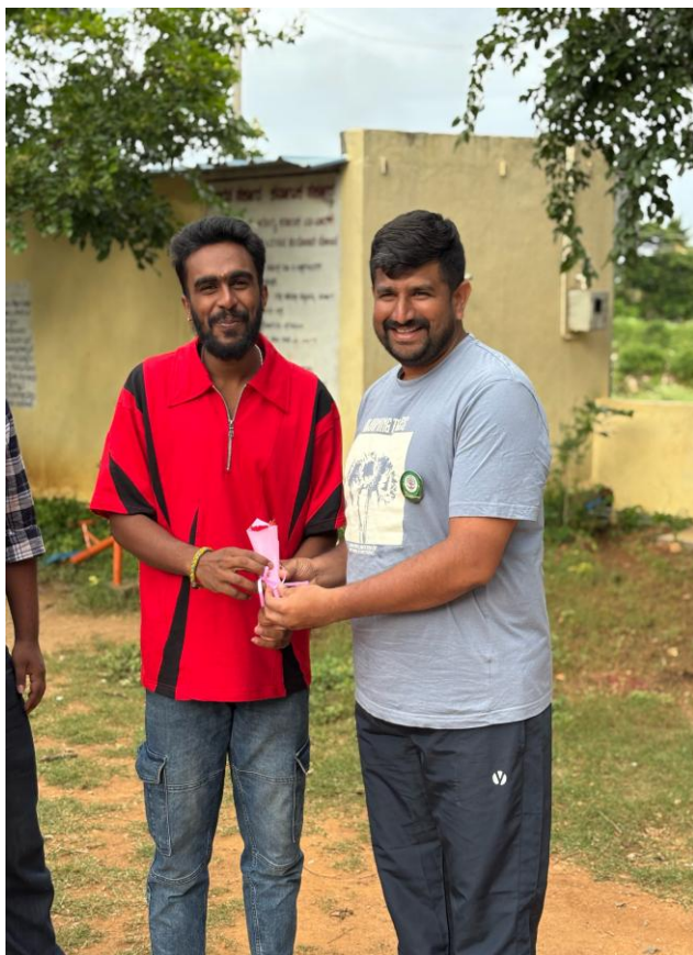
Felicitating flag hoisting guest