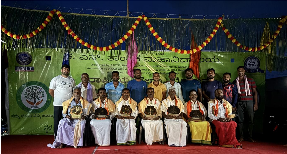
Felicitating to the Chief Guests of the Cultural Event.