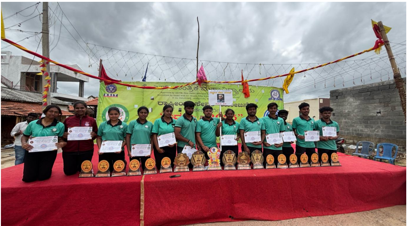
Team Kuvempu - Best Overall Performance Award