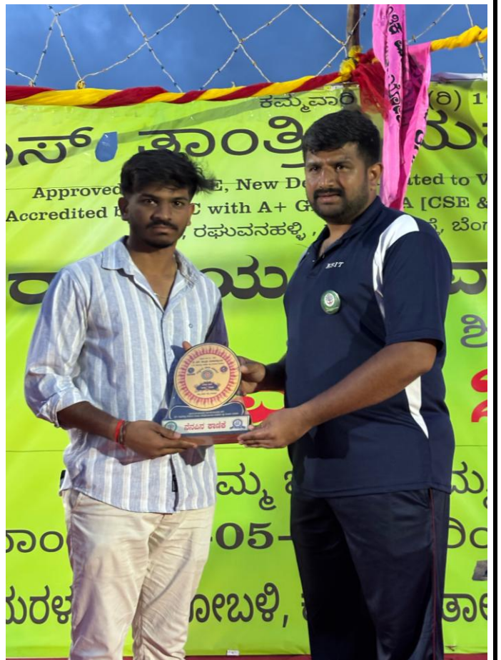
Felicitating NSS volunteer