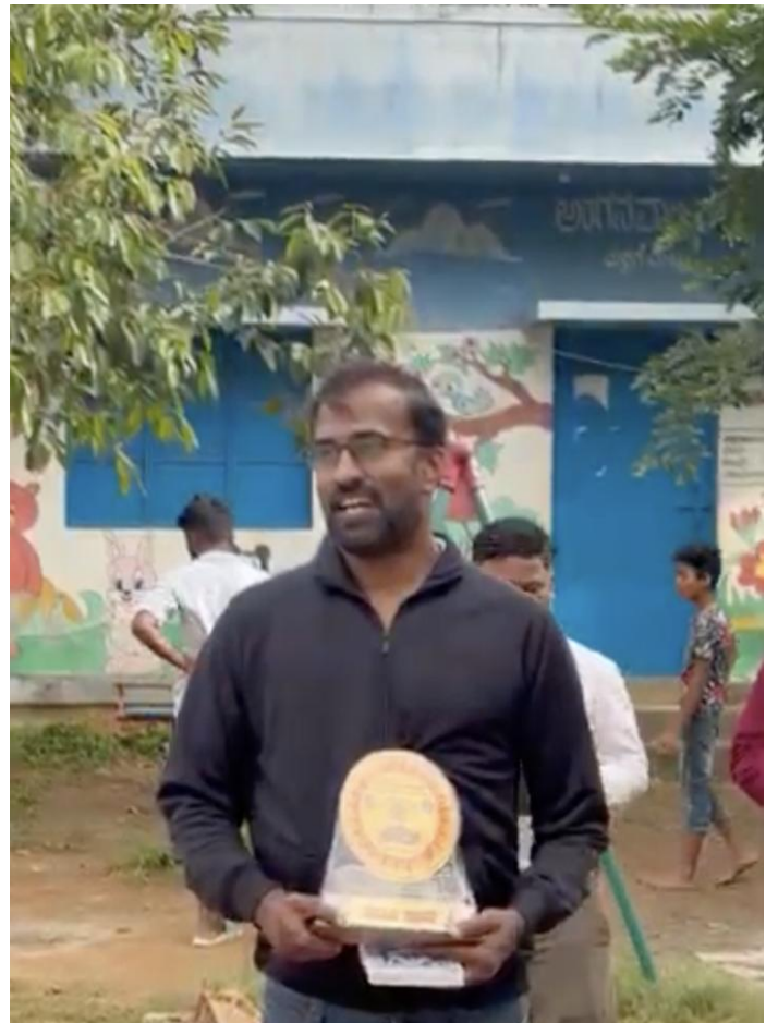
Felicitating flag dehoisting guest