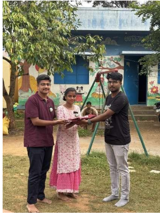
Flag dehoisting by NSS volunteers