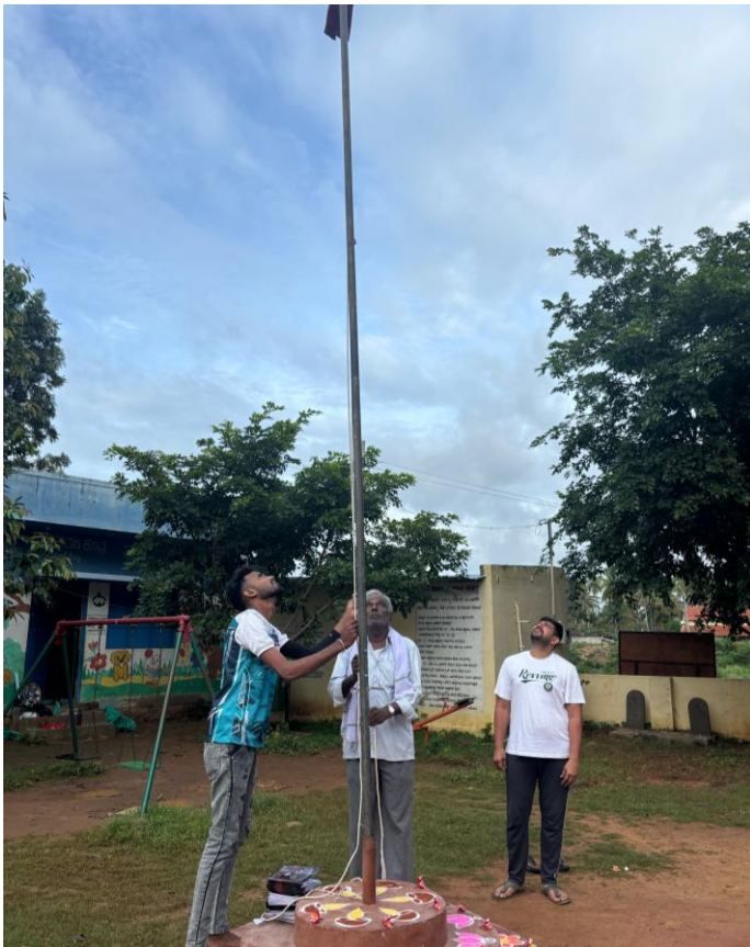
Flag hoisting by guest