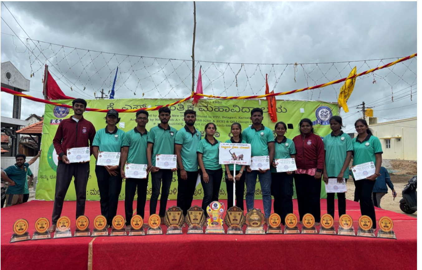
Team Kitturu Rani Channamma - Award for Excellence in Shramadhana