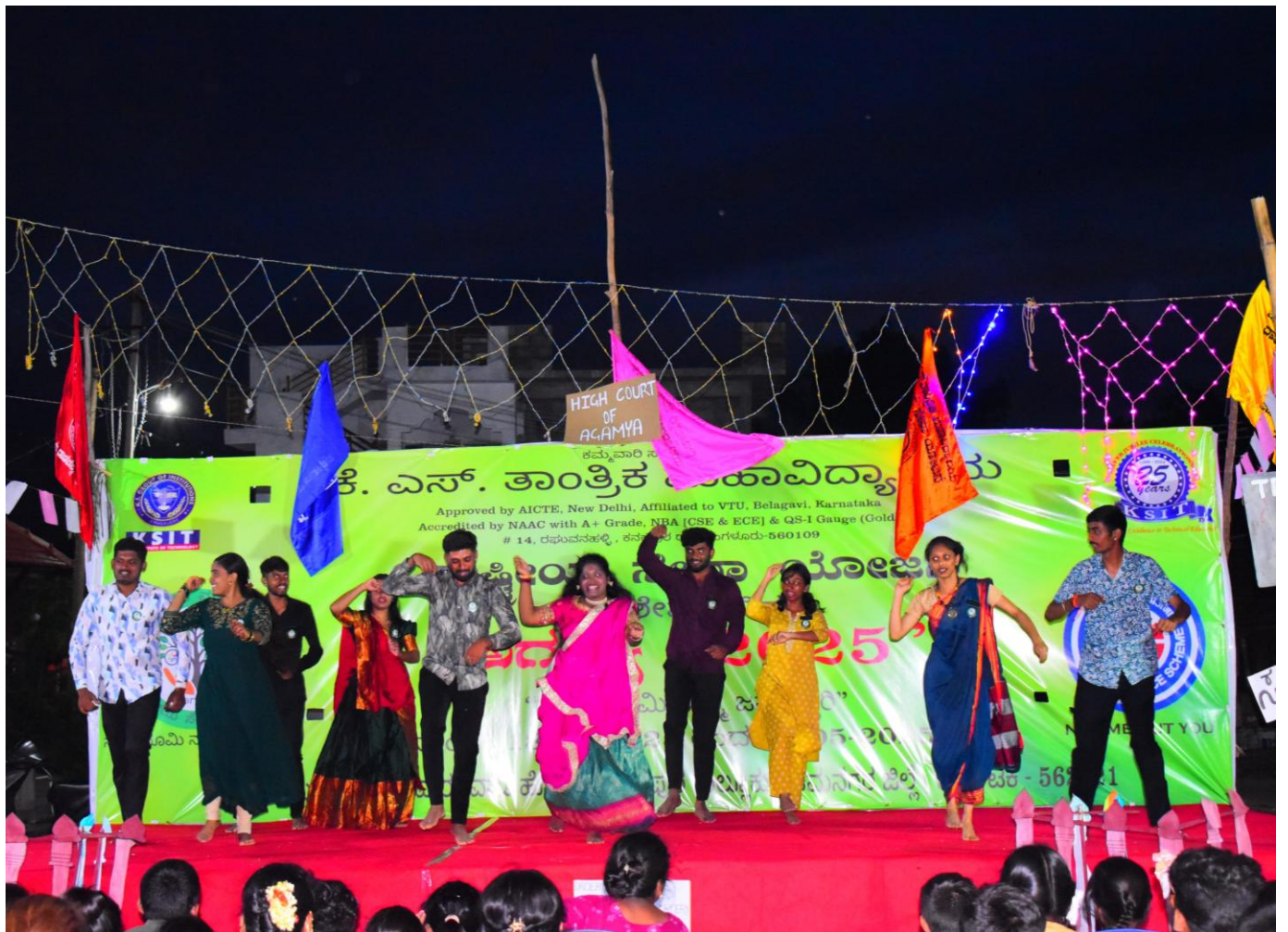
Dance performance by NSS volunteers.