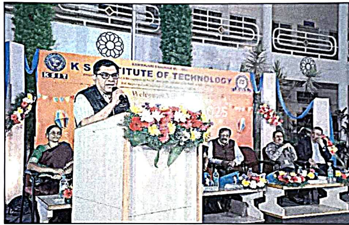
Cultural Activities for Alumni meet.