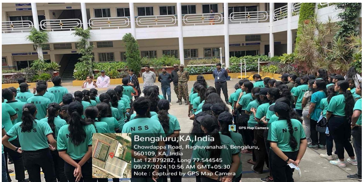
BBMP Head and her team sharing insights on the importance of Swachh Bharat.