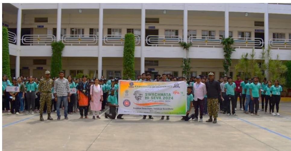
Principal inaugurating the rally – Group photo with participants before the rally.