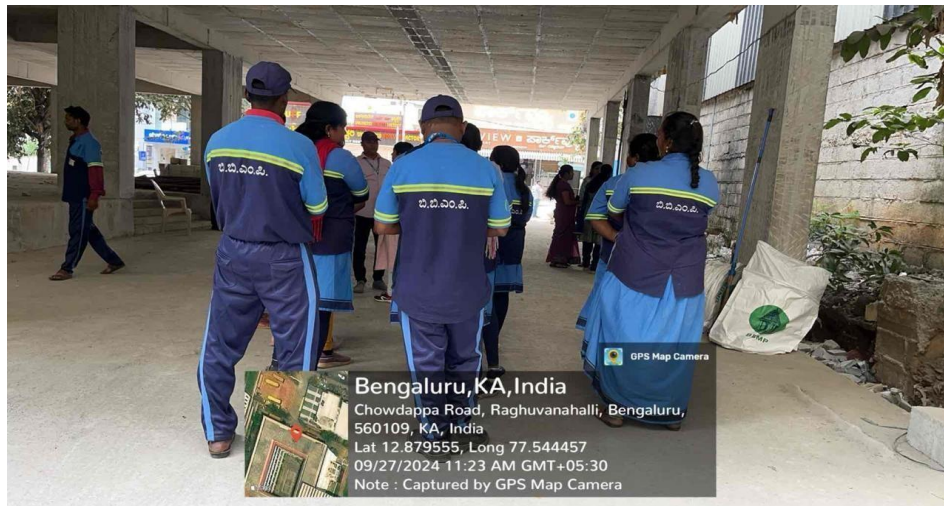
BBMP volunteers actively participating in the rally.