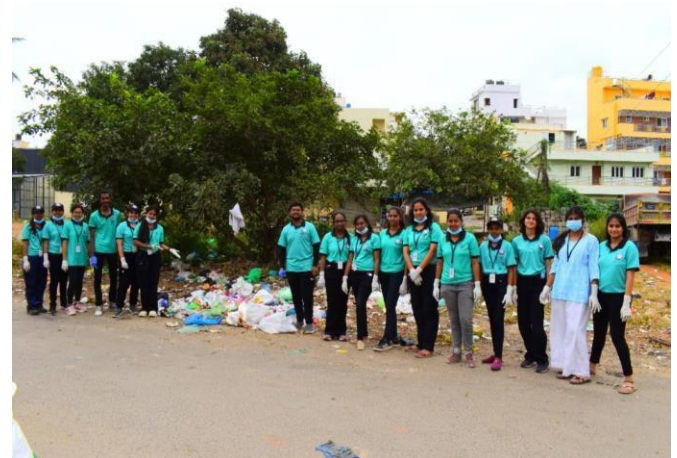
NSS volunteers cleaning the streets as part of the Swachh Bharat initiative.