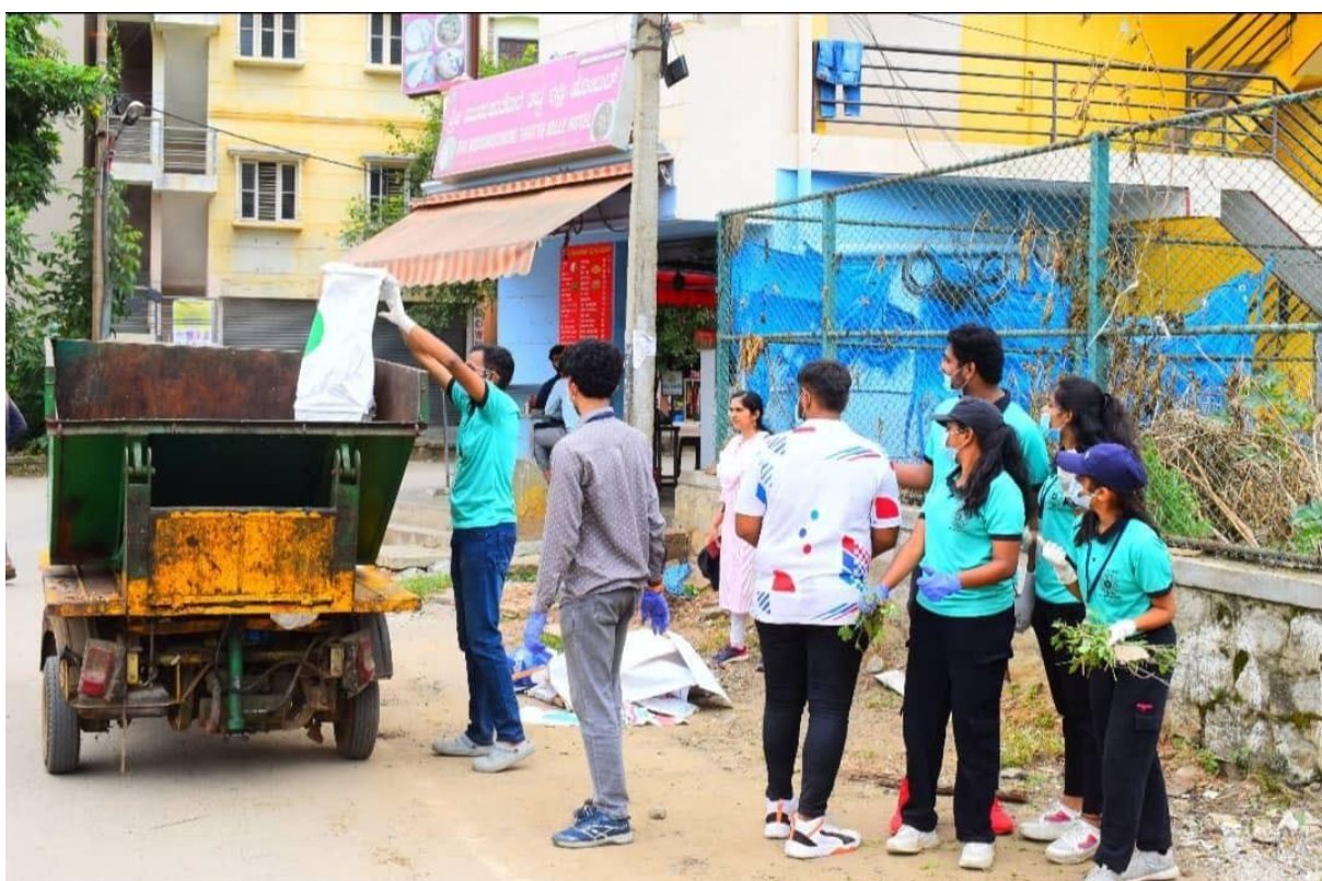
Collecting plastic and other waste and transferring it into the BBMP waste collection van.