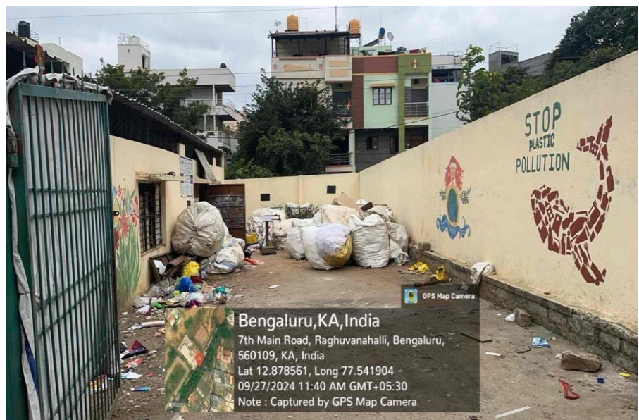
Waste collection center where the collected waste is processed for further handling.