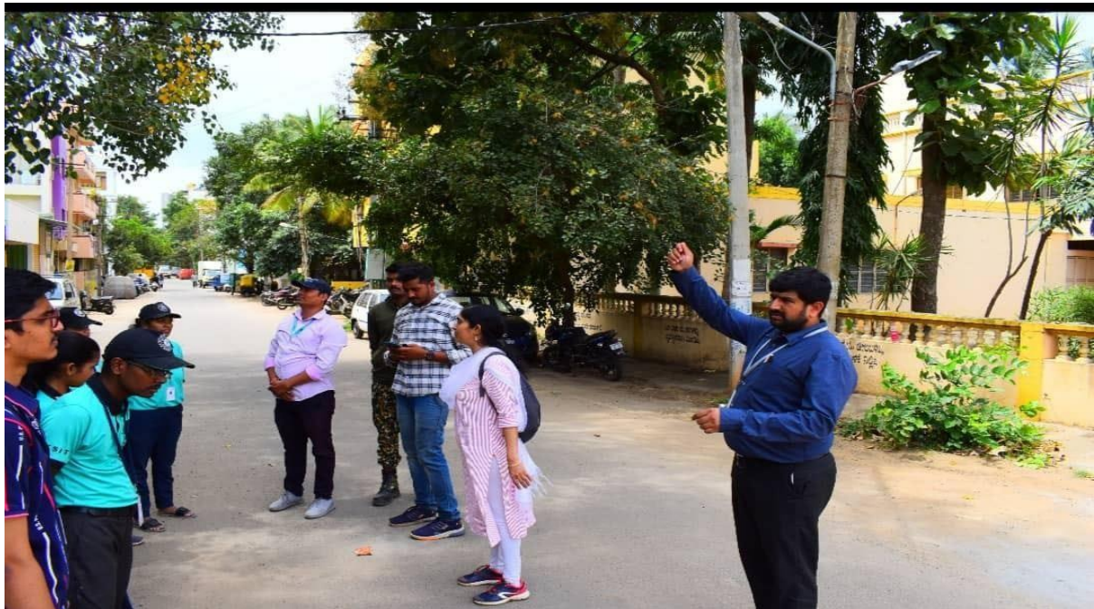
Instructions by BBMP Head and NSS Program Officer to clean the streets and collect plastic and other waste.