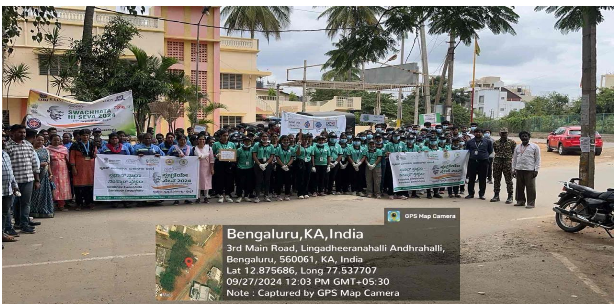
Group photo after successfully completing the Swachh Bharat Abhiyan program.