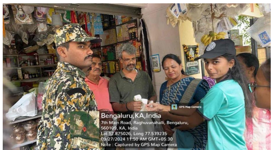
NSS volunteers, BBMP AEE, and marshals creating awareness among shops and hotels, distributing cloth bags as an alternative to plastic.