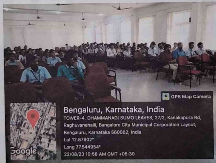
Glimpse during lecture – CSE 4 th Semester students & Faculty members