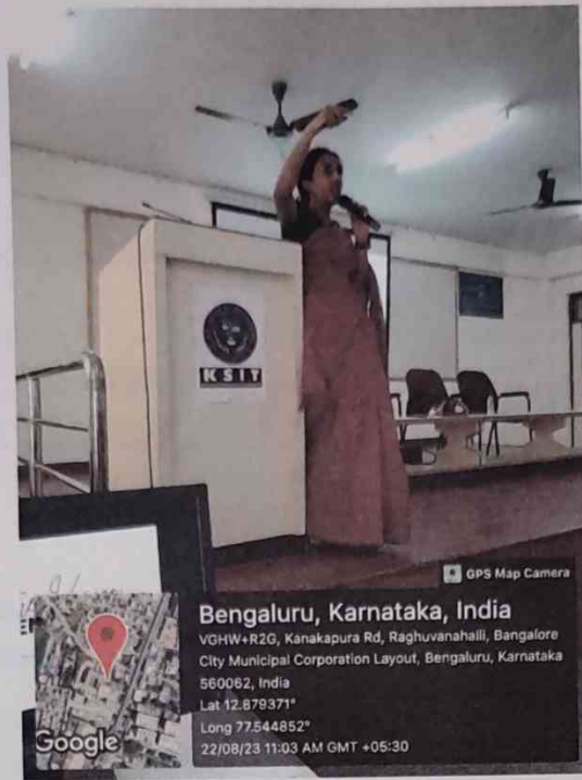
Glimpse during lecture delivery on “Entrepreneurship – Venture Vision”