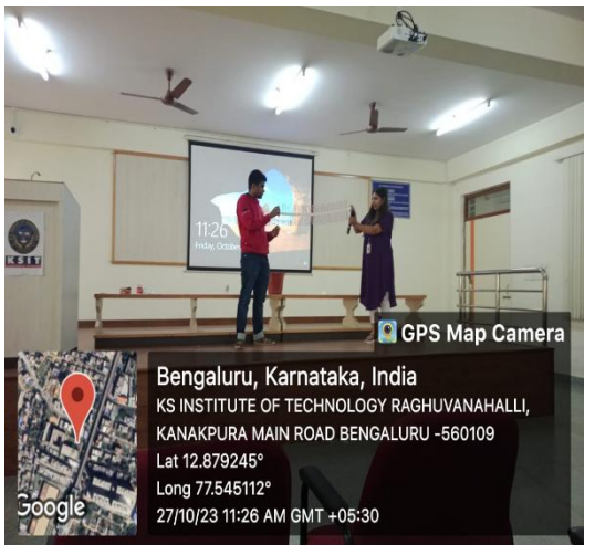
Fig: YFS members teaching session