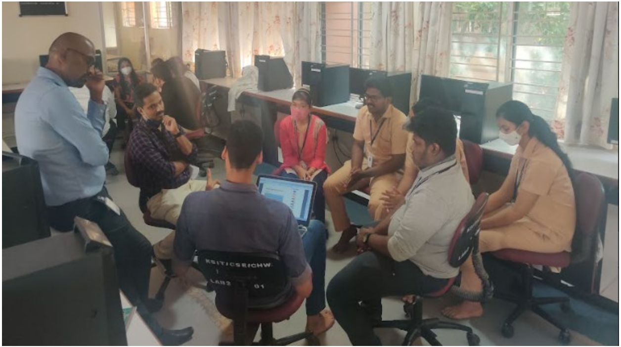
Judging by the Jury