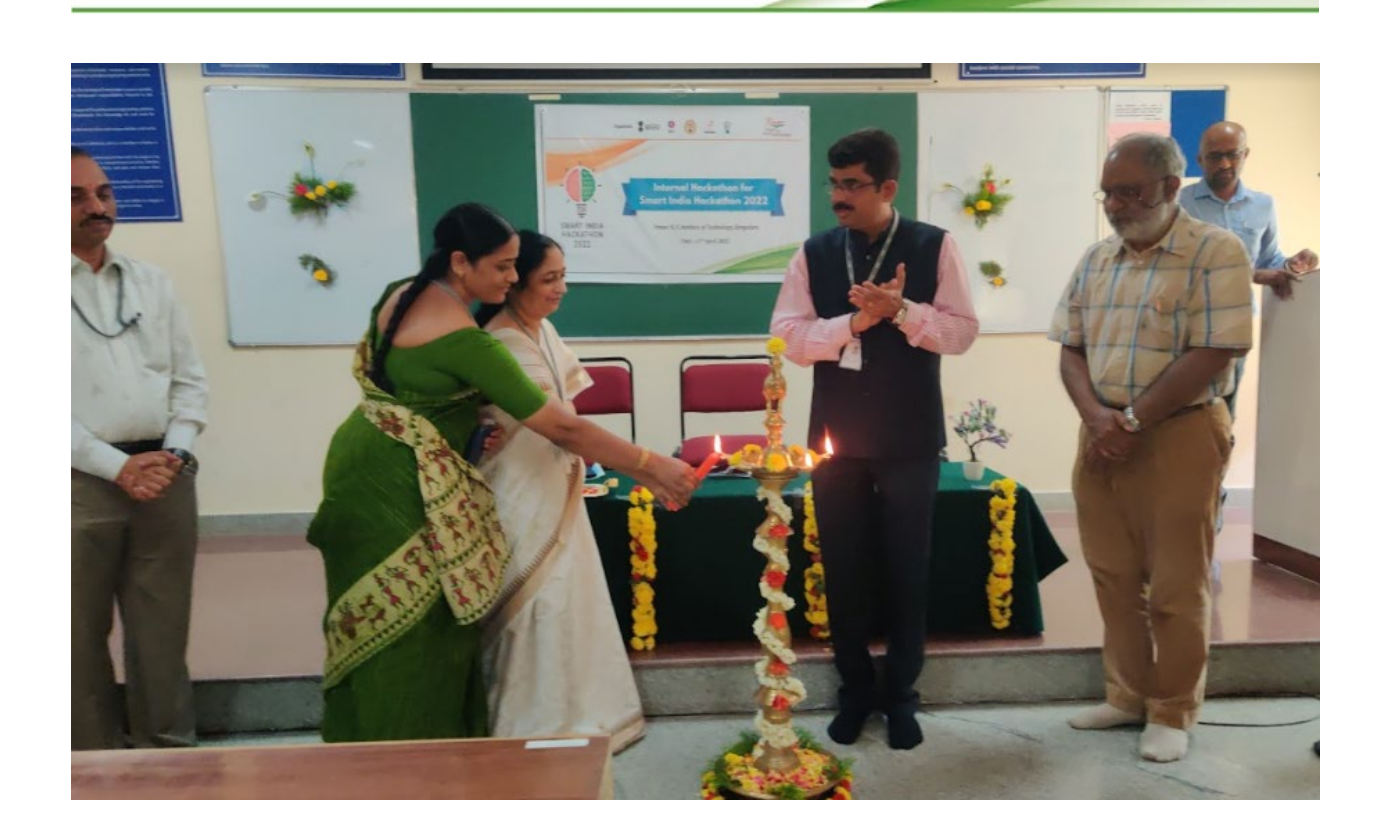
Inaguation of Internal Smart India Hackathon-2022