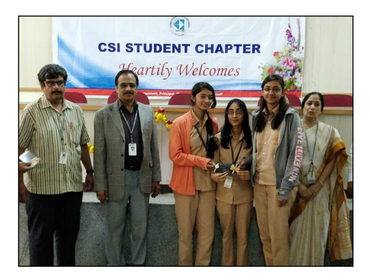
Consolation prize winners