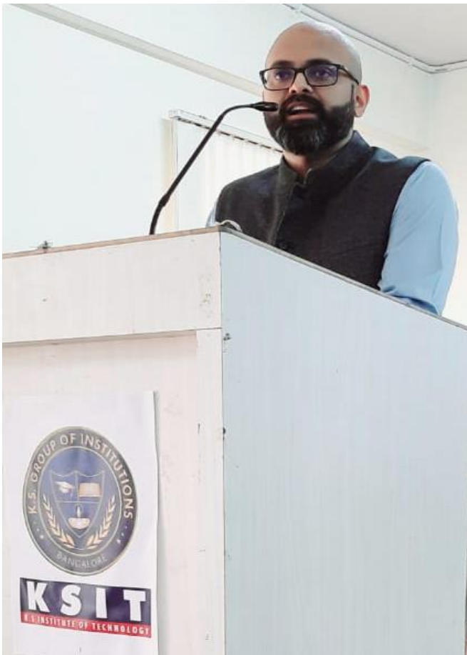
Chief Guest addressing the queries of Students