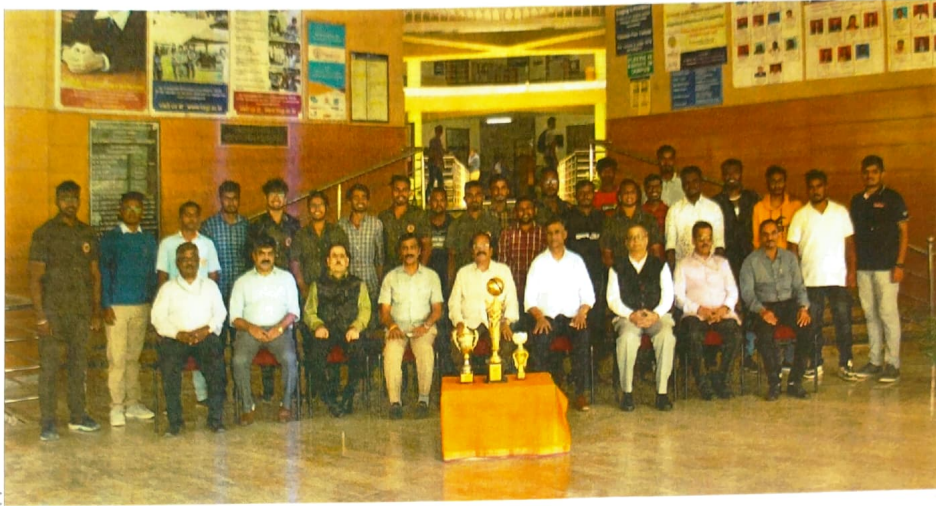
Photograph 11: Team with Management, CEO sir, Principal sir AFTER winning TROPIES The event was held in May 2022.

Achievement: 2 nd OVERALL Championship- ALL India Ranking 2 nd Place in Flat Dirt race 2 nd Runner up in Nigh Endurance race