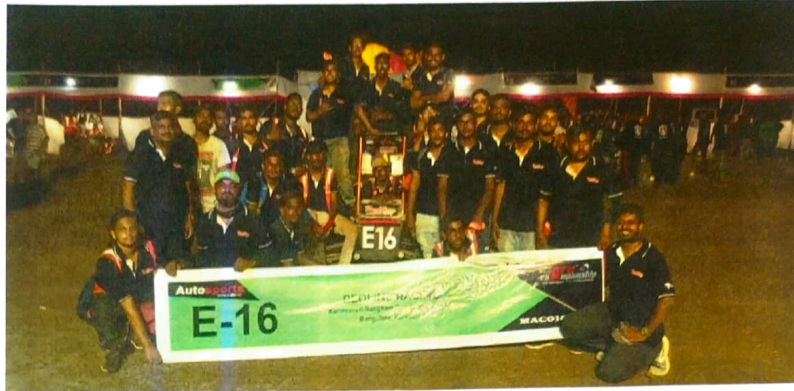
Photograph 8: Team after completing all the events