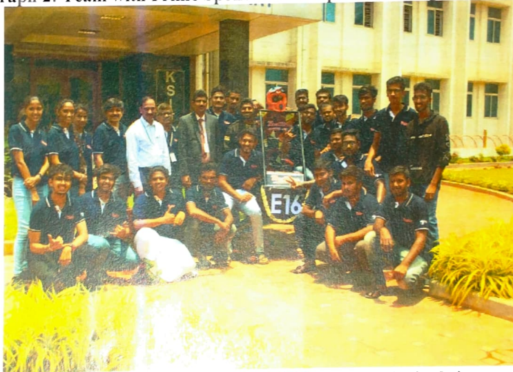
Photography 3: Team with HOD sir and Principal sir