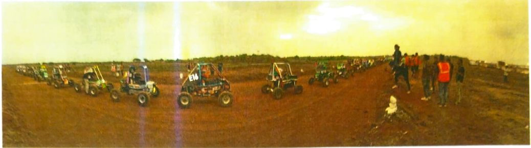
Photograph 5: E- 16 on Line up in NIGHT ENDRANCE RACE