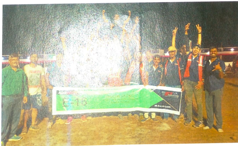
Photograph 10: Team cheering after winning