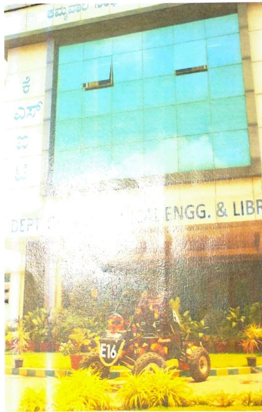
Photograph 1: Vehicle ready to compete