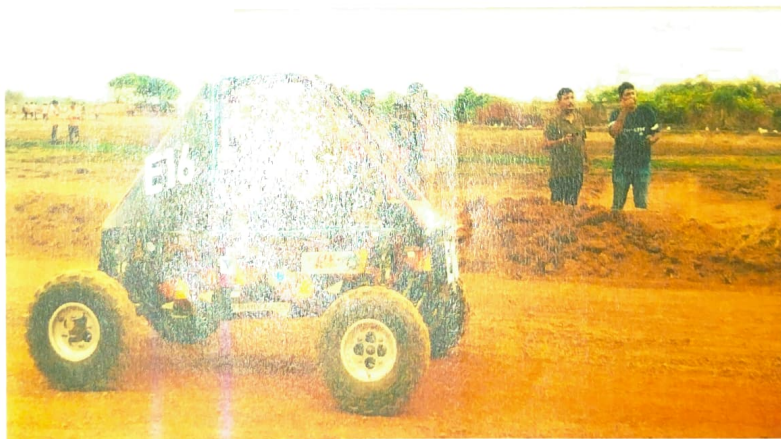
Photograph 7: E- 16 on Final ENDURANCE RACE