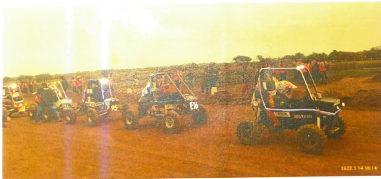
Photograph 4: E- 16 on FLAT DIRT RACE