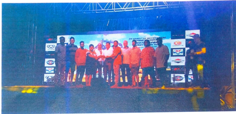
Photograph 9: Team members receiving the TROPY in Valedictory at Goa