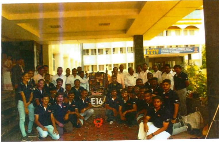
Photograph 2: Team with Prime Sponsors of Respected Management Committee