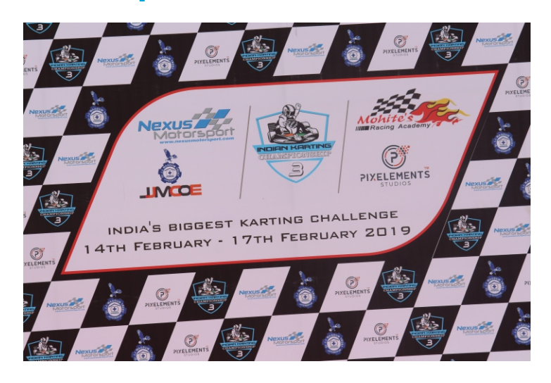
From 14<sup>th</sup> to 17<sup>th</sup> February 2019 held at Mohite's Racing Academy, Kolhapur Maharashtra organized by Nexus Motorsport.

It is an intercollegiate engineering design competition which involves Static and Dynamic stages.