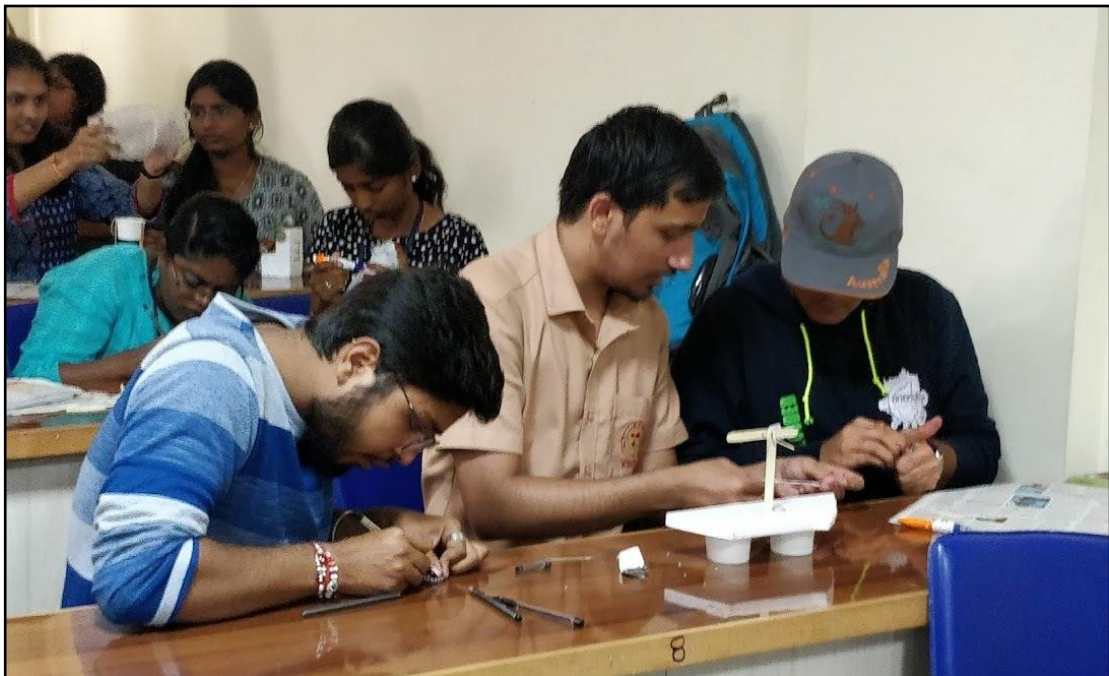
Teams building their products