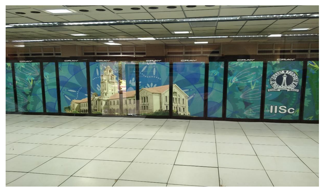
This is CRAY XC40 which is found here.

The Cray XC40 supercomputer is a groundbreaking architecture upgradable to 100 petaflops per system and delivering: • Sustained and scalable application performance • Tight HPC optimization and integration • Production supercomputing • Investment protection – upgradability by design • User productivity