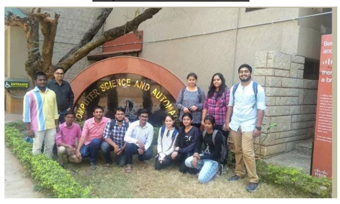
Computer Science and Related Events