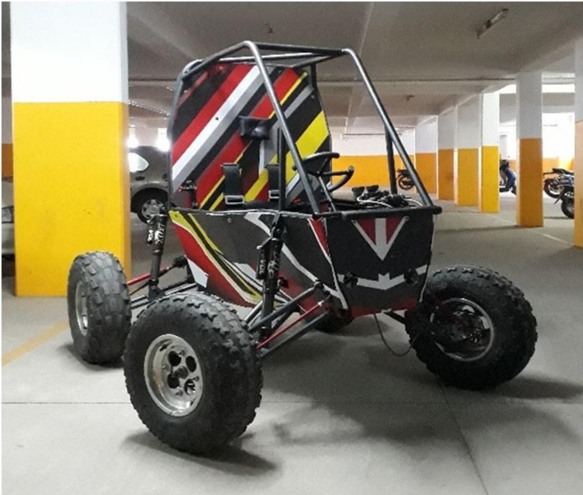
Students designed and fabricated an off road buggy for competing in Mega ATV Championship organized by Autosport India to be held during the month of April 2021 in Goa