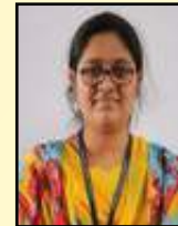
B.V. NAVYA 1KS15TE010 8.29 (SGPA)