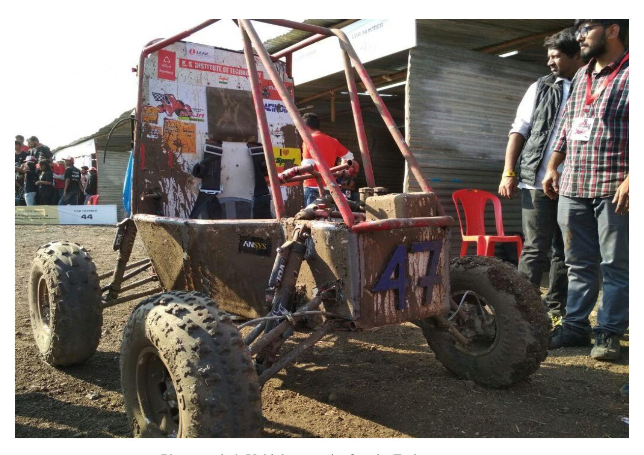
Photograph 4: Vehicle near pit after the Endurance race