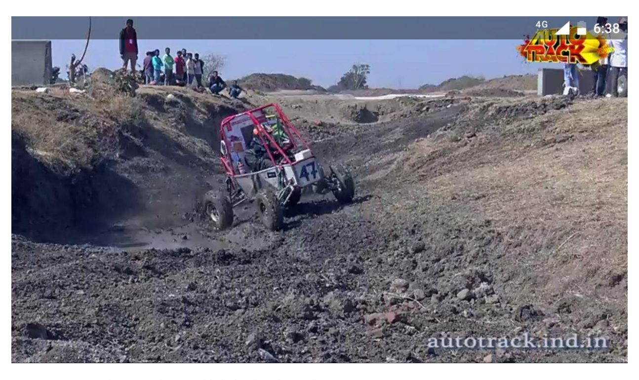
Photograph 3: Vehicle in the obstrucle KALAPANI, ENDURANCE RACE