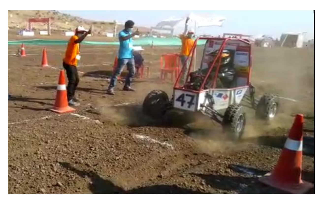
Photograph 2: clearing the brake test